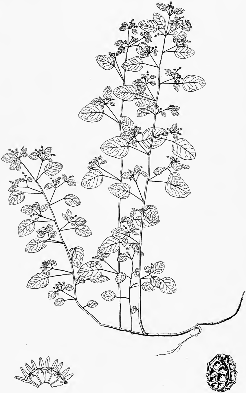
EUPHORBIA ARMOURII , sp. nov.