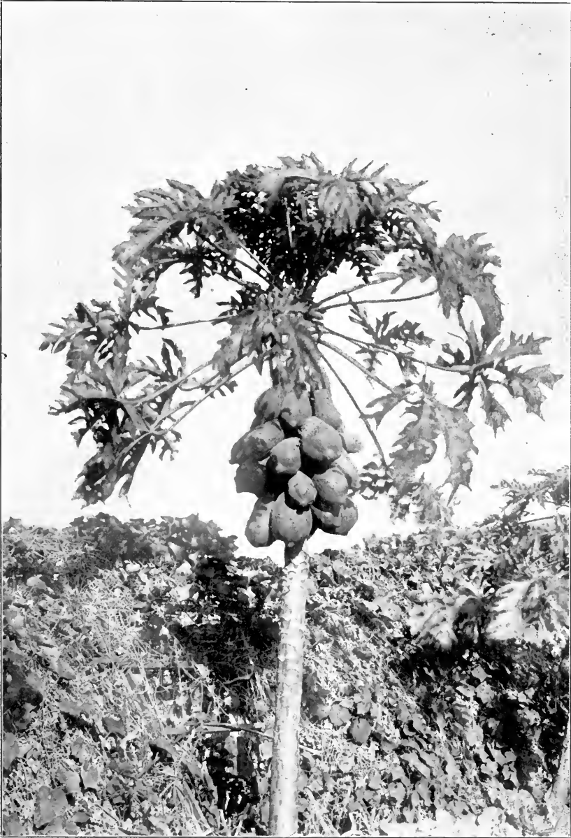
CARICA PAPAYA, Linn. (Cultivated.)