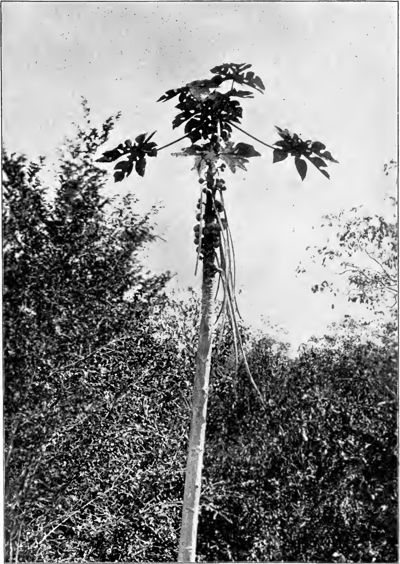
CARICA PAPAYA, Linn. ( Natural. )