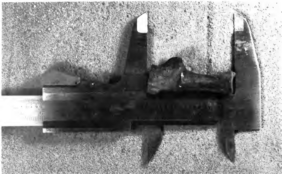
FIG. 2. The calcaneum positioned in calipers to measure maximum length (table 1).

of the calcaneum (terminology following Hughes & Dransfield, 1953). In no case was there any species-specific difference discernible in the samples available. I conclude that, on morphology alone, the specimen could be attributed to a dhole or to a primitive, dingo-like form of domestic dog. Arguments for a more positive identification must be based on nonmorphometric grounds.