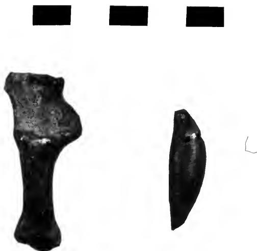
FIG. 1. The dhole calcaneum and canine tooth from Agop Sarapad, Madai caves, Sabah. Scale is in centimeters.