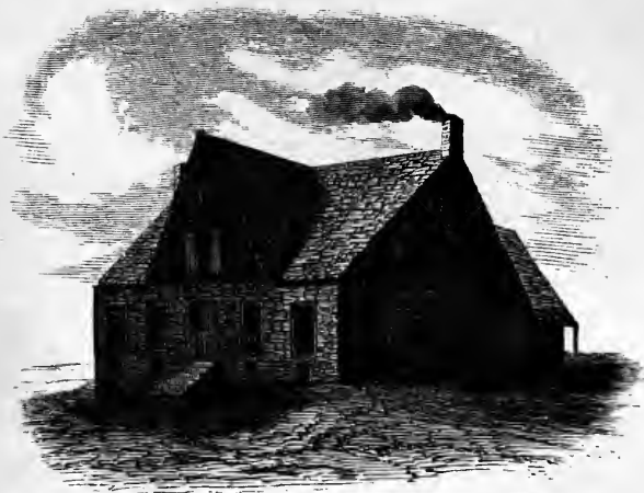
THE OLD KOEYMANS MANSION.