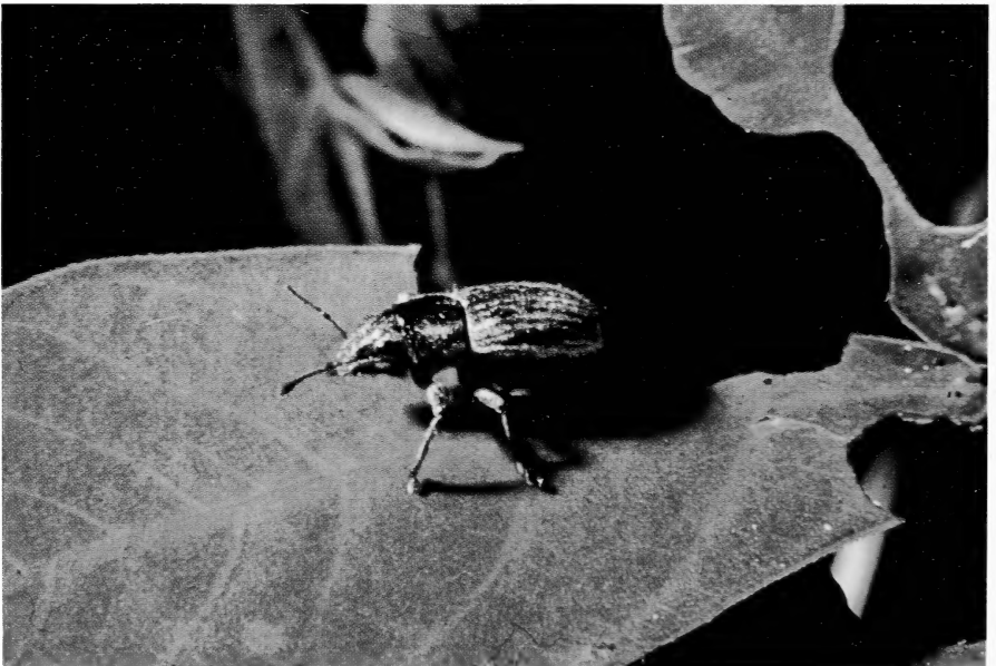
Feeding of adult white-fringed beetle.