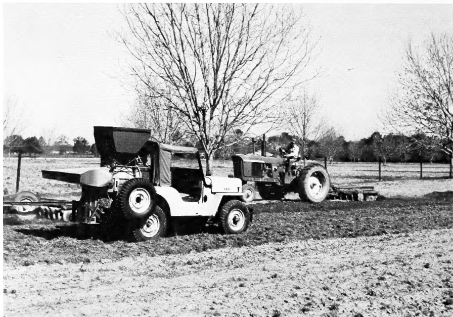
Applying granular insecticide to soil.

Chlordane applied to the soil will give control for 3 years. Row treatment