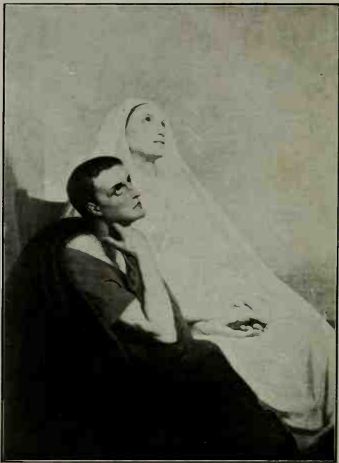
AUGUSTINE AND HIS MOTHER.