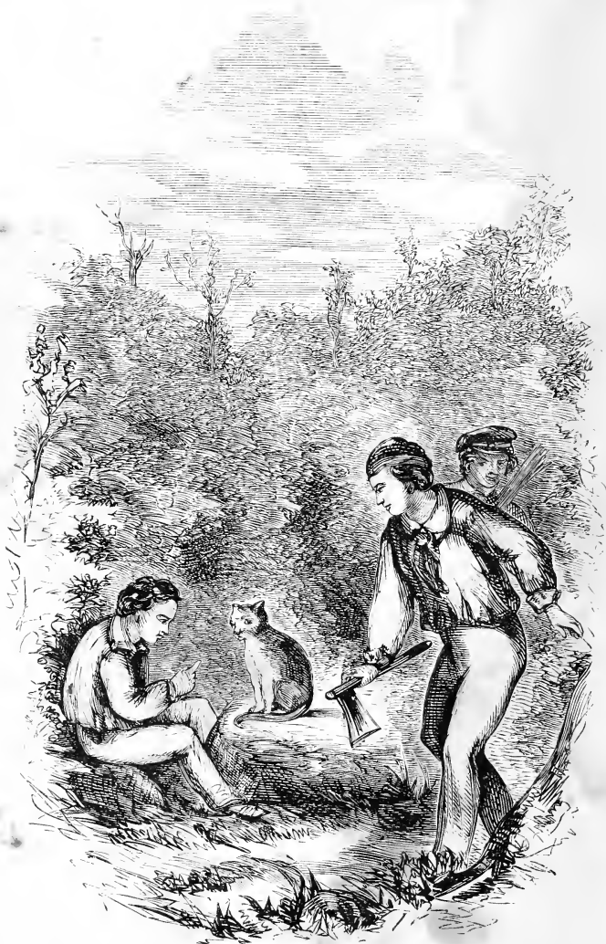
PETERKIN CAUGHT CONVERSING WITH THE CAT. Page 145