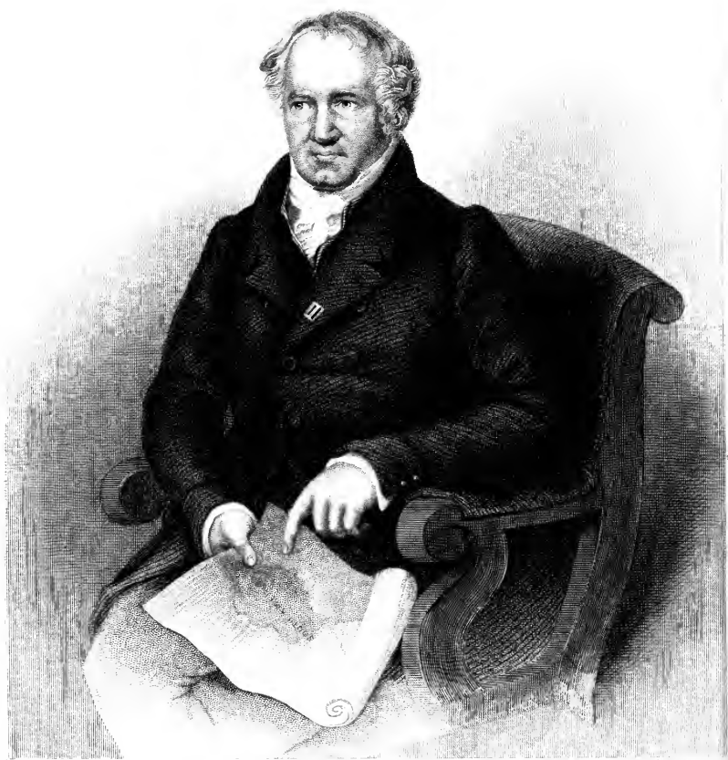
Alexander von Humboldt.