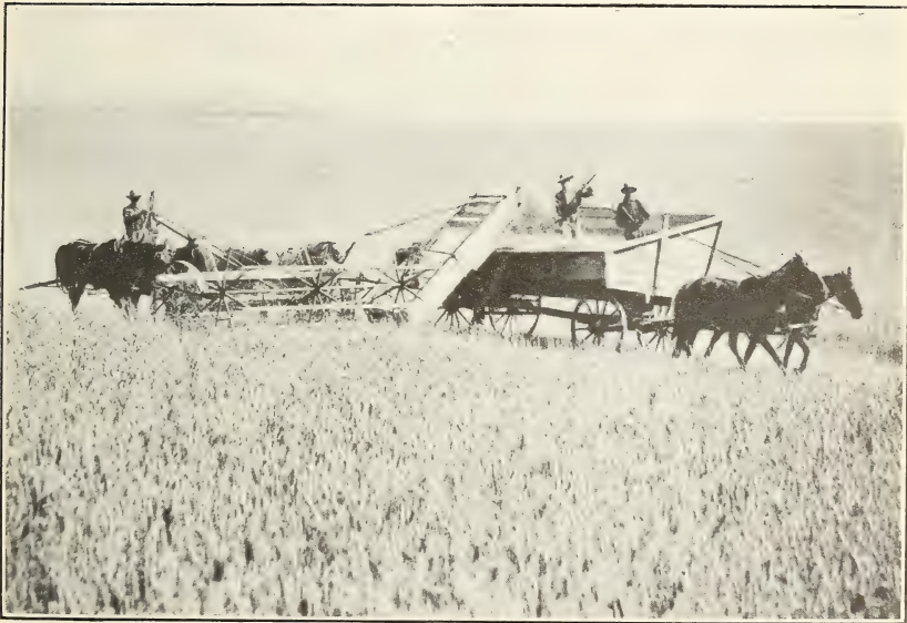
FIG. 2.—HORSE-DRAWN HEADER IN OPERATION.