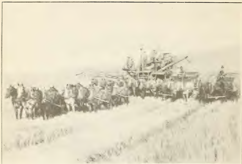
FIG. 1.—HORSE-DRAWN COMBINE IN OPERATION.