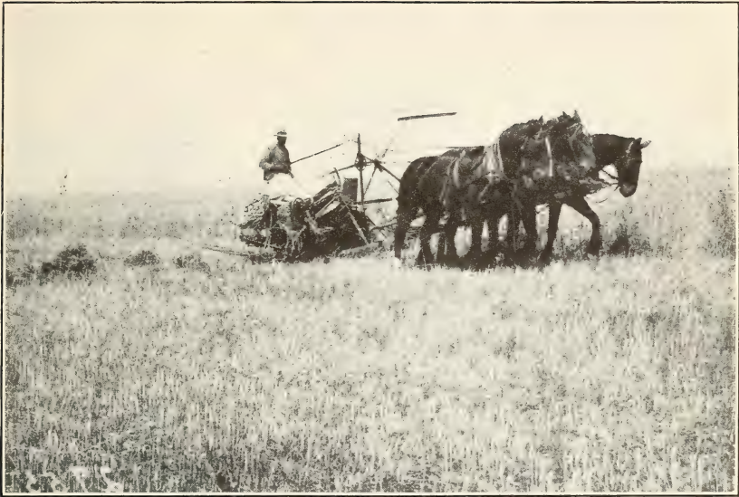
FIG. 1.—BINDER IN OPERATION.