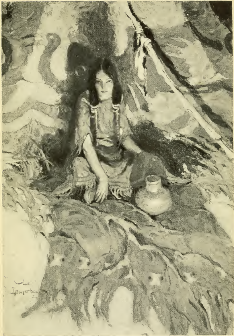
“—a squaw named Yellow Bird sent word that you would be welcome.”