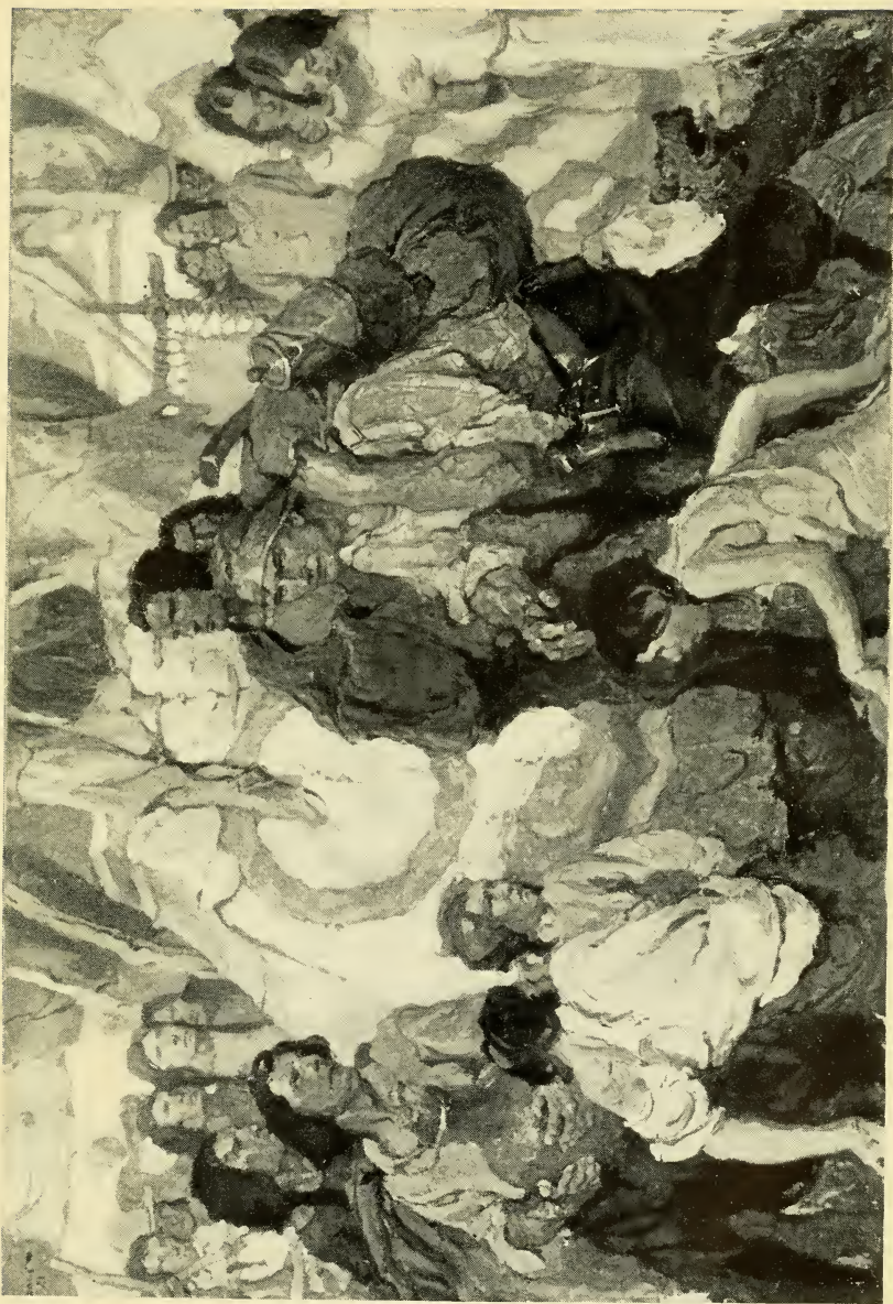
They hurried to the camp, the children racing ahead to tell the news.