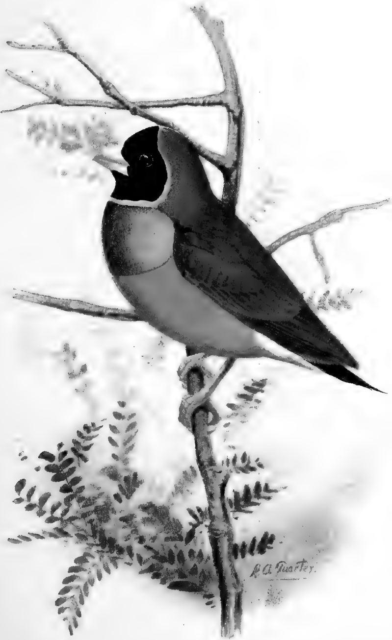
LADY GOULD FINCH.