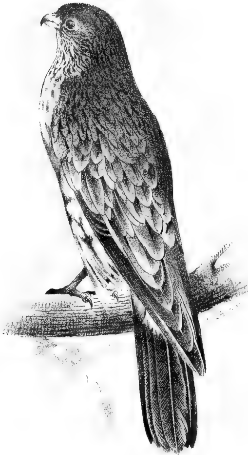
FALCO COLUMBARIUS SUCKLEYII