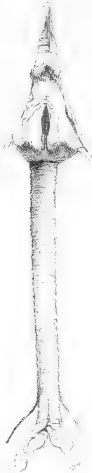
Trachea, Larynx and Tongue of Machæramphus Anderssoni , ♀ nat size Drawn from Nature by C J Andersson.