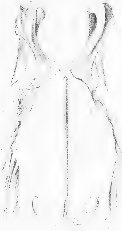
Front View of Sternum of Machæramphus Anderssoni , ♀ nat size, Drawn from Nature by C. J. Andersson