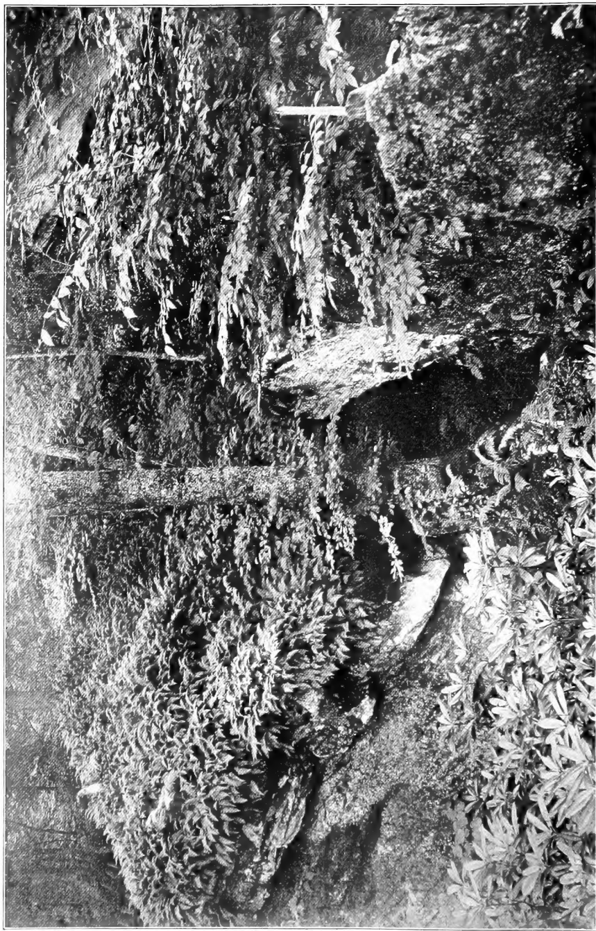
I. Vegetation on Yew Mountains, Greenbrier County