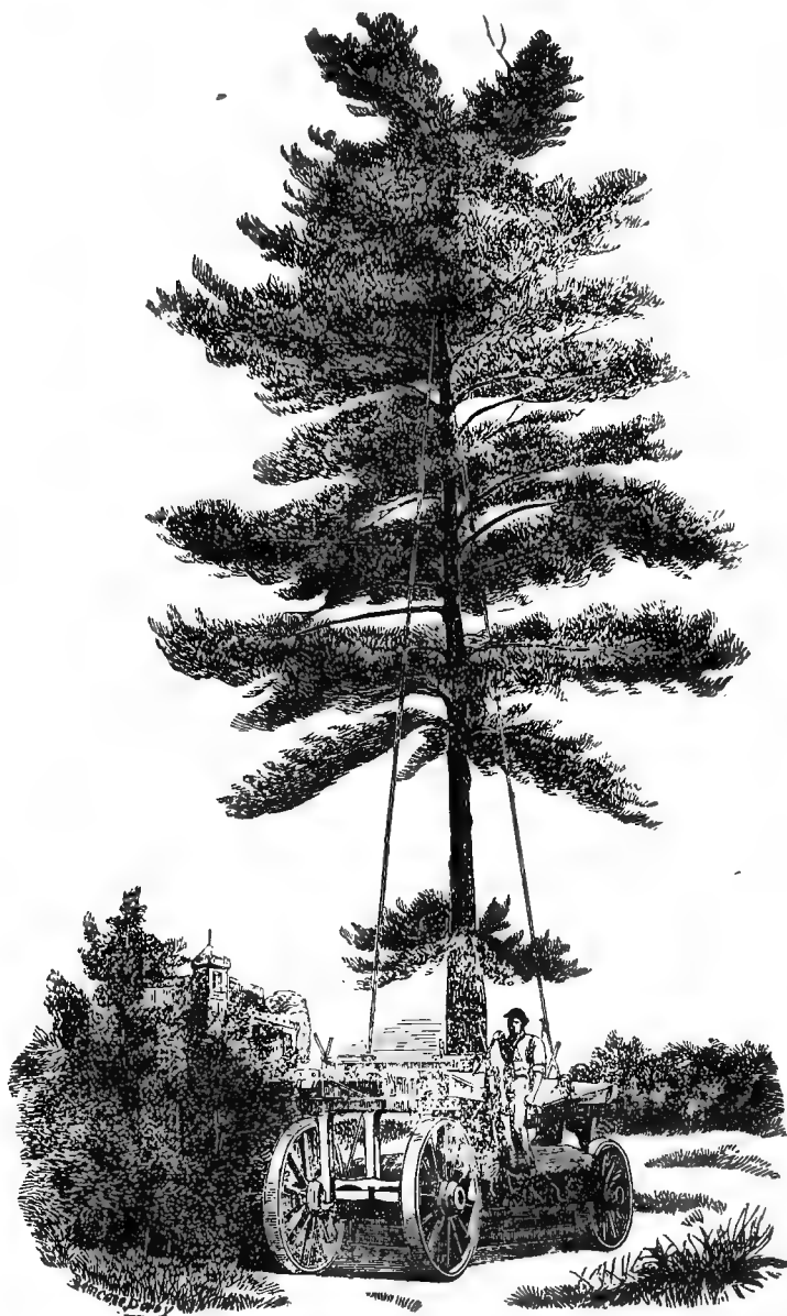
W. BARRON & SON'S TRANSPLANTING MACHINE.