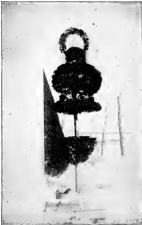
Red Cedar Trained in the Form of a Lantern.