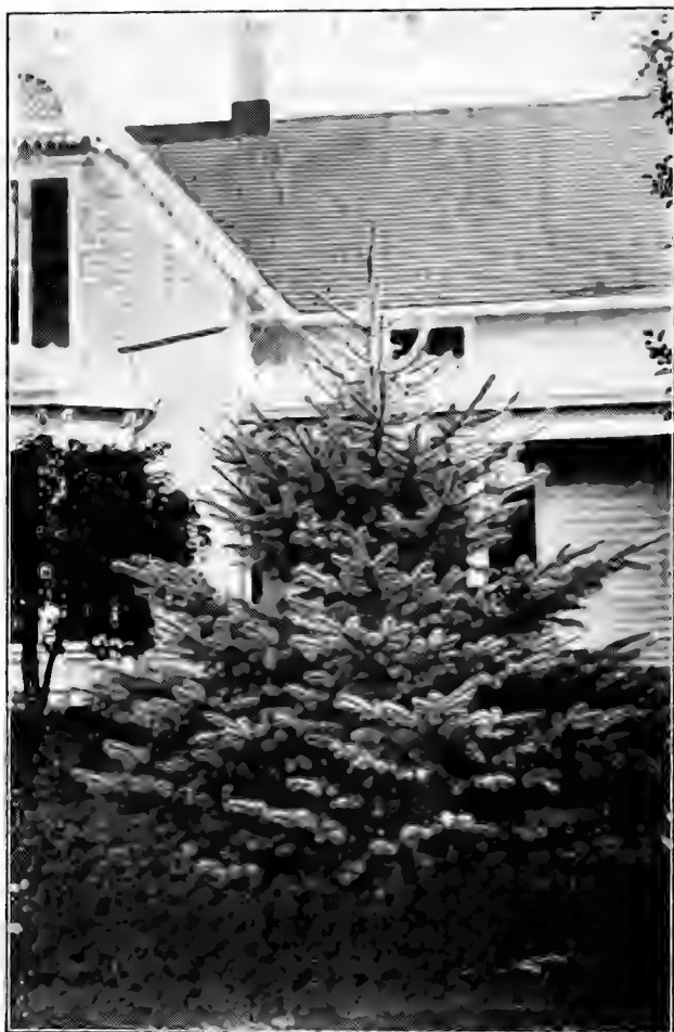
Picea Pungens. (Colorado Blue Spruce.)