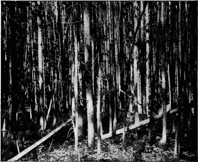
Native Forest of Pinus contorta Growing in Idaho.

The body and the branches of this tree seem to belong to two entirely distinct systems. The trunk is straight as an arrow, and the limbs are the crookedest things that grow on a tree. The first time I saw a grove of them I stopped and studied them a long time. The foliage is of yellowish green, in fine contrast to the neighboring Concolor. No straighter tree grows in any forest, but as the lower limbs die and are dried up, they turn and knot and twist like so many writhing serpents, forming one of the most striking contrasts in tree life.