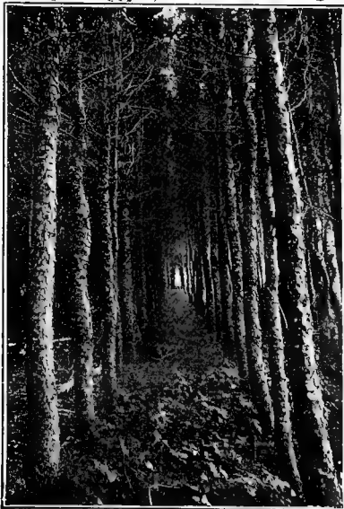
European Larch in Western Minnesota.

This is a deciduous Conifer from the mountains of Tyrol. It was planted largely in the Highlands of Scotland where it succeeded admirably. About sixty years ago there was much interest taken in this tree in our Northern states. In Illinois there were beautiful plantations forty years ago. Standing by itself it is a charming tree. The main stem is straight as an arrow and it will often have graceful pendulous branches which droop symmetrically on every side like green fountain sprays. In a forest it allows close planting and bears a great burden of