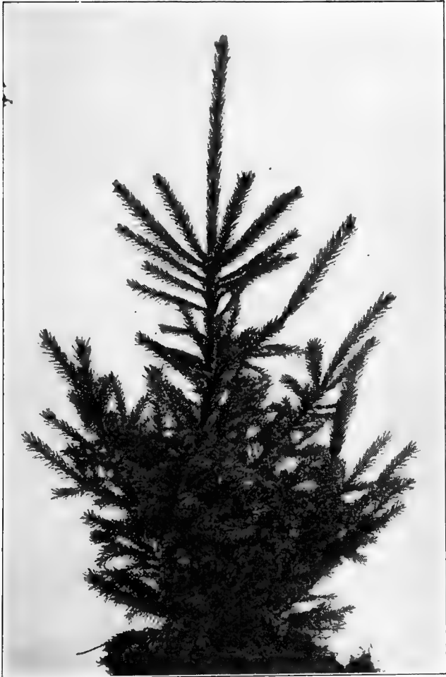
Black Hills Spruce.