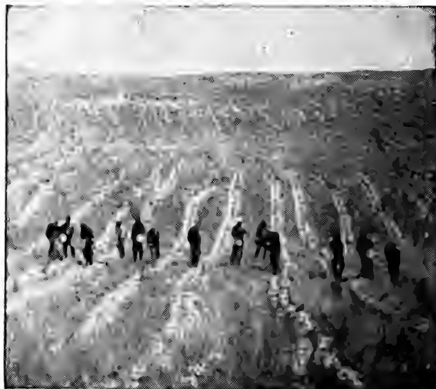
Planting Trees in Furrows on the Dismal River Forest Reserve in Nebraska.

Growth of Pine Trees. Pine trees do not make rapid growth the first and second year after they are set out in the hills, but after that their growth is quite surprising. On an area of five square rods that was staked off for a sample plot, planted to jack pine in 1903, there are thirty-four trees, the average height of which is 11 inches, the average height growth of these trees for this year is 6.56 inches, or 69½ per cent, of their entire height. This is but the beginning of their growth, and it will not surprise me if they average one foot in height growth in another year.