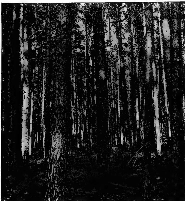
Norway Pine In Minnesota Forest.

South. But while that will endure any amount of heat, this will endure the severest cold but is very sensitive to the heat. I have often tried it in Nebraska, sometimes keeping it under a screen, but hot winds with 110° in the shade would always kill it. They will doubtless do well in North Dakota, the northern half of Minnesota, and in northwest Canada, for they grow wild in Manitoba. It is a more rapid grower than the White Pine. The Jack Pine at first will outgrow it but it is sure to overhaul it sooner or later.