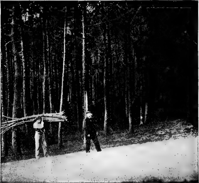
Forest of Maritime Pine on the Drifting Sand Dunes of France.

At least one-fifth of this great state is sand and comparatively worthless. How to save this immense area is a problem. The effort to forest this region was in a measure inspired by the remarkable success secured in France in kindred circumstances.