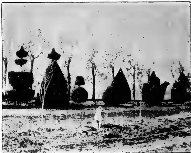
Showing topiary work in Red Cedars.

Topiary Work Among Evergreens. —This term refers to or-