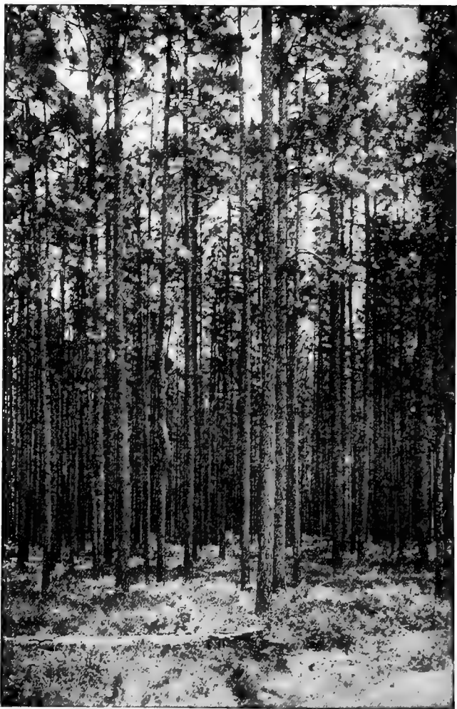
Forest of Long Leaved Pine in Florida.