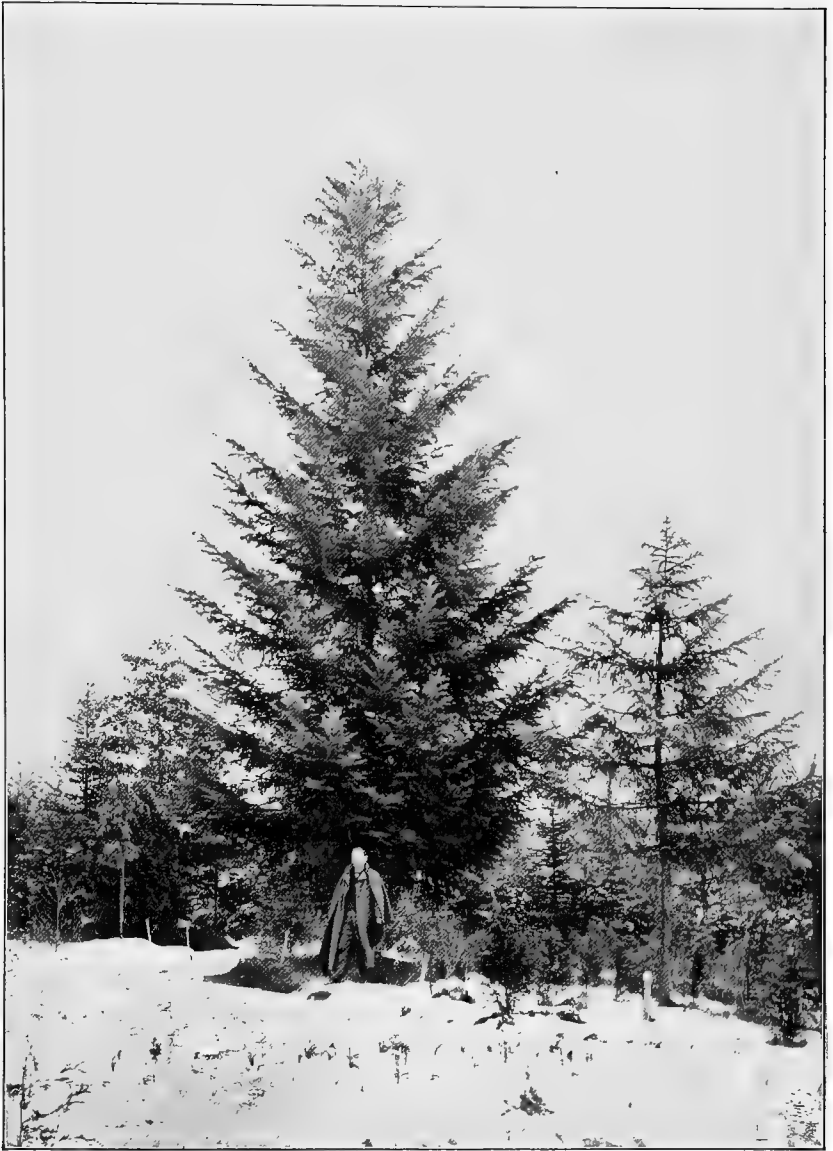
FIG. 3. Douglas Fir, twenty years old and twelve metres high, in the Experimental Forest Gardens of Grafrath.