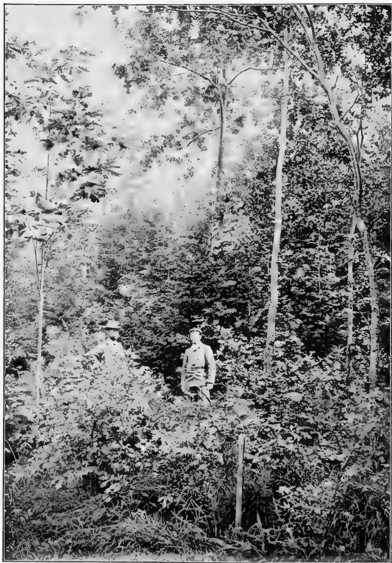
FIG. 2. Thirty-year Oaks underplanted with Chamaecyparis lawsoniana for fifteen years in the Experimental Forest Gardens of Grafrath.