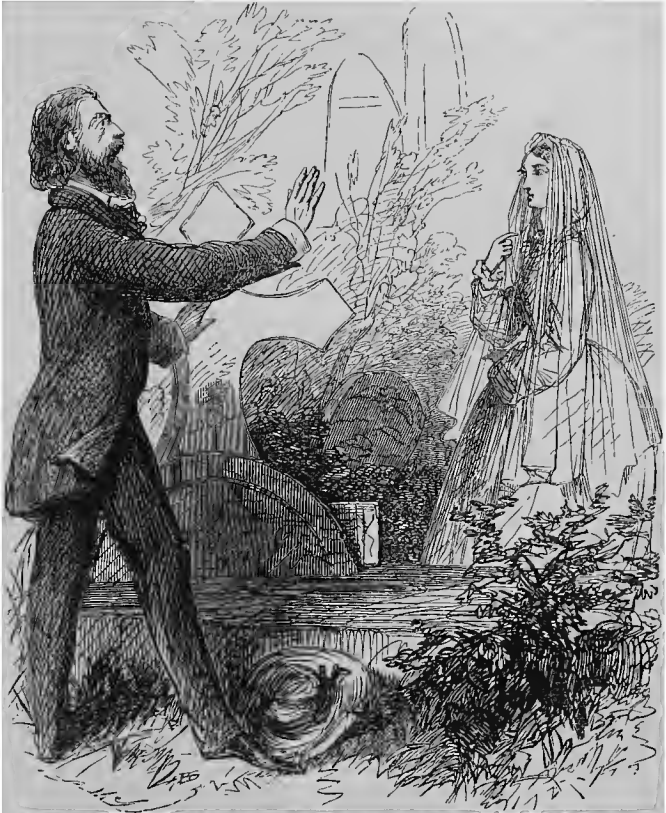
LAURA, LADY GLYDE, WAS STANDING BY THE INSCRIPTION, AND WAS LOOKING AT ME OVER THE GRAVE.