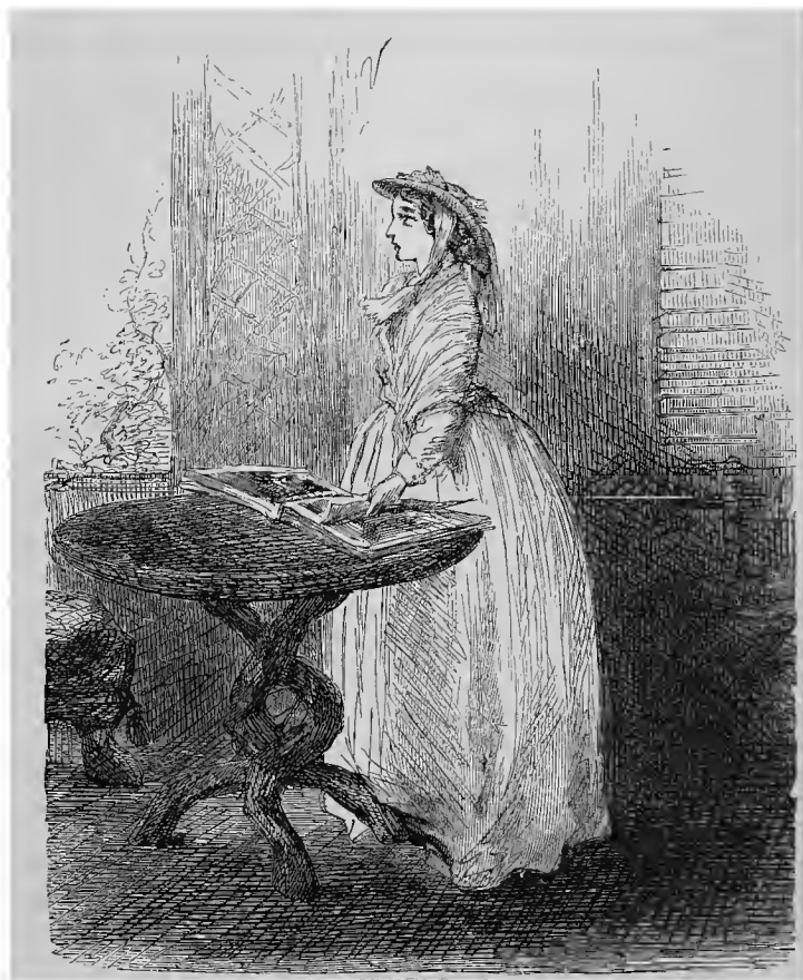
SHE WAS STANDING NEAR A RUSTIC TABLE.