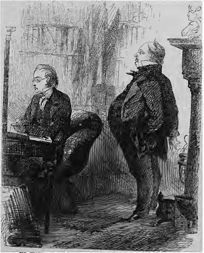
HE WALKED TO THE FIRE-PLACE AND WARMED HIMSELF.