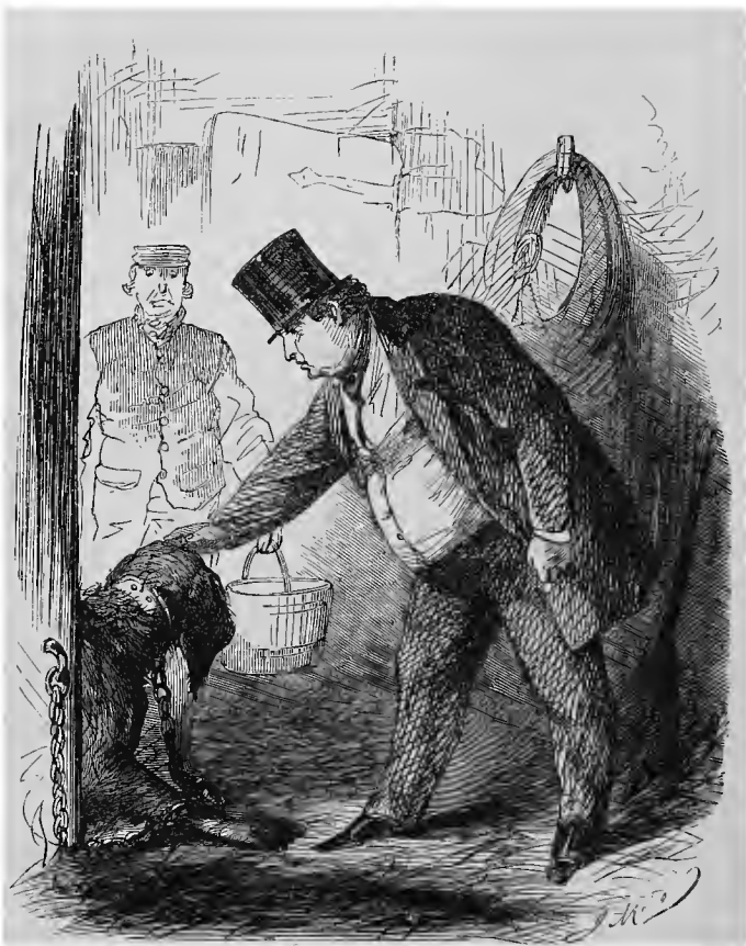
COUNT FOSCO AND THE DOG.