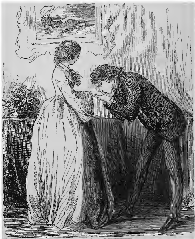
MY HEAD DROOPED OVER IT, MY TEARS FELL ON IT, MY LIPS PRESSED IT.