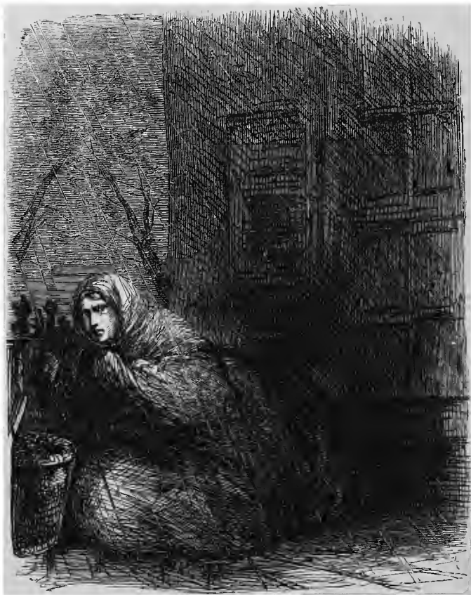
THE STRANGENESS AND PERIL OF MY SITUATION.