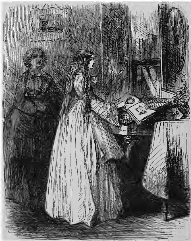
AND PINNED IT CAREFULLY IN THE FORM OF A CIRCLE.