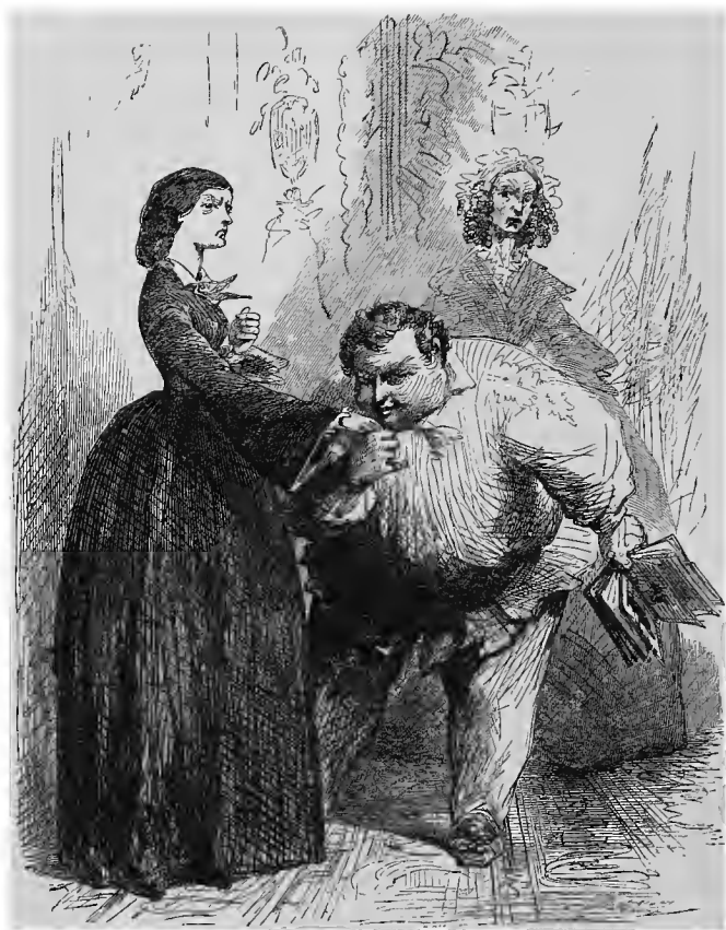
HE TOOK MY HAND AND PUT IT TO HIS POISONOUS LIPS.