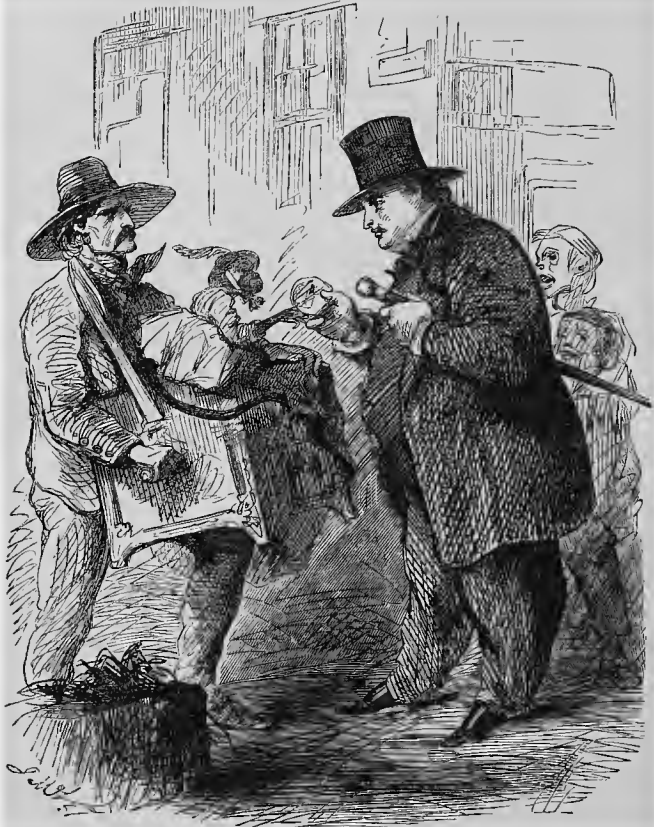
"MY POOR LITTLE MAN!" HE SAID.