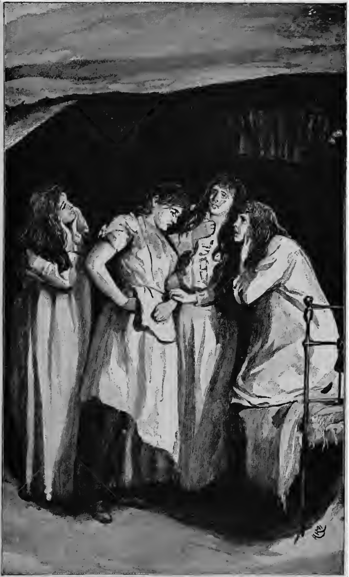
"THEY HUNG ABOUT HER IN THEIR FLOWING WHITE NIGHTGOWNS."