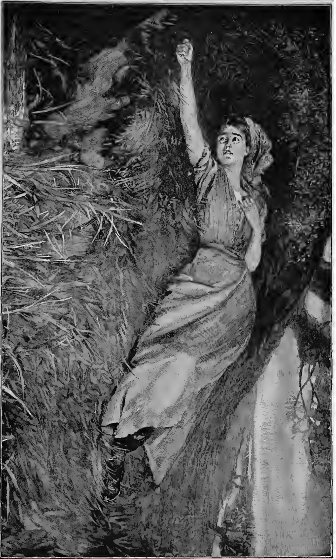
"SHE FLUNG HERSELF DOWN UPON THE RUSTLING UNDERGROWTH OF SPEAR-GRASS AS UPON A BED."