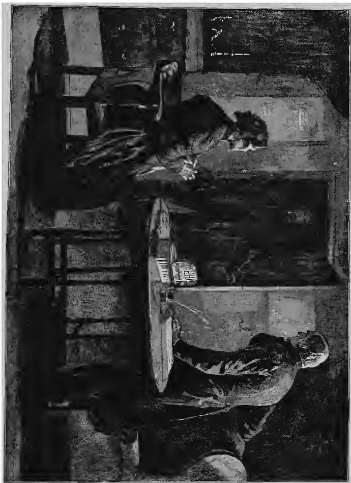
“ HIS FATHER AND MOTHER WERE BOTH IN THE DRAWING ROOM.”