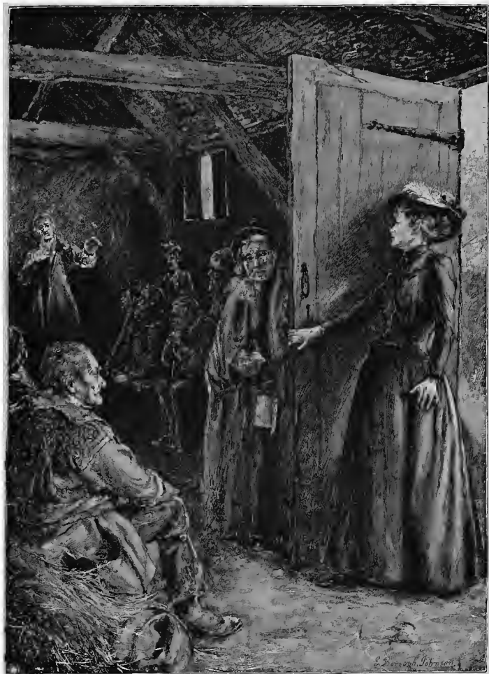
THE PREACHER WAS ALEC D'URBERVILLE.