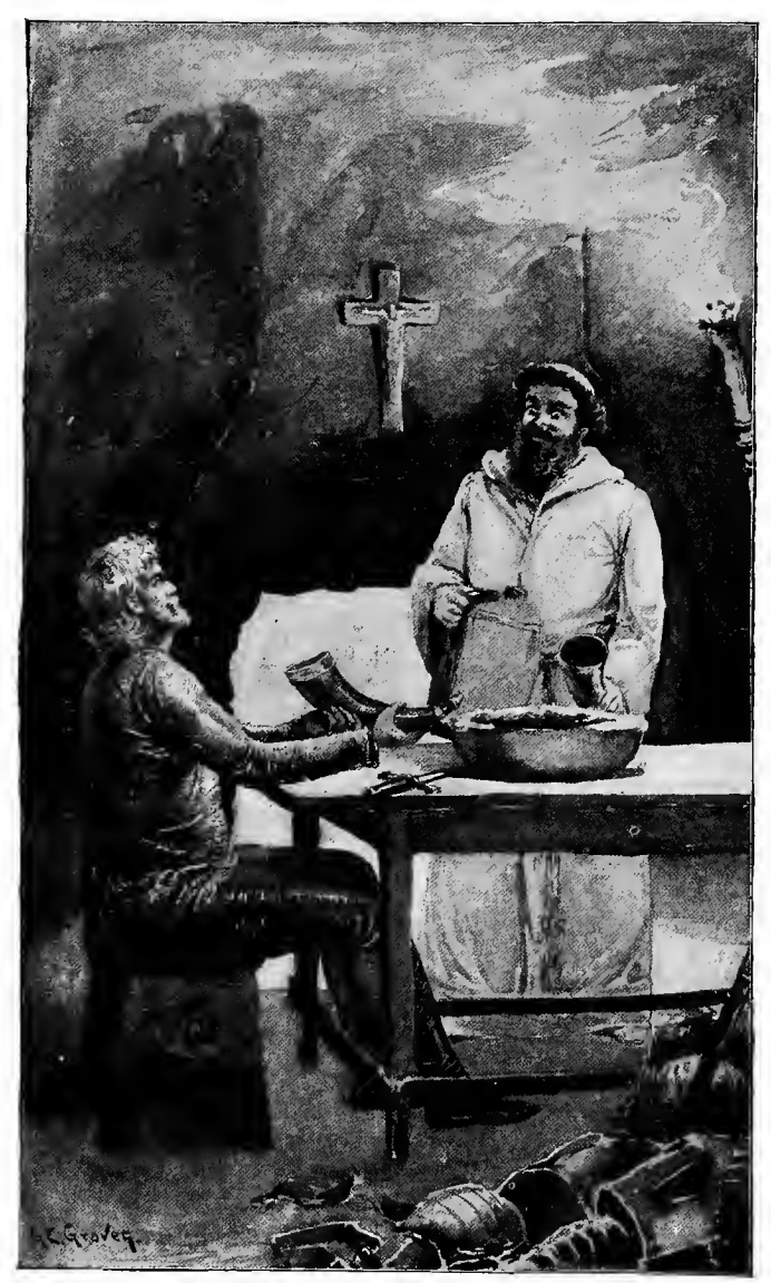
DRINK HAEL, HOLY CLERK OF COPMANHURST.