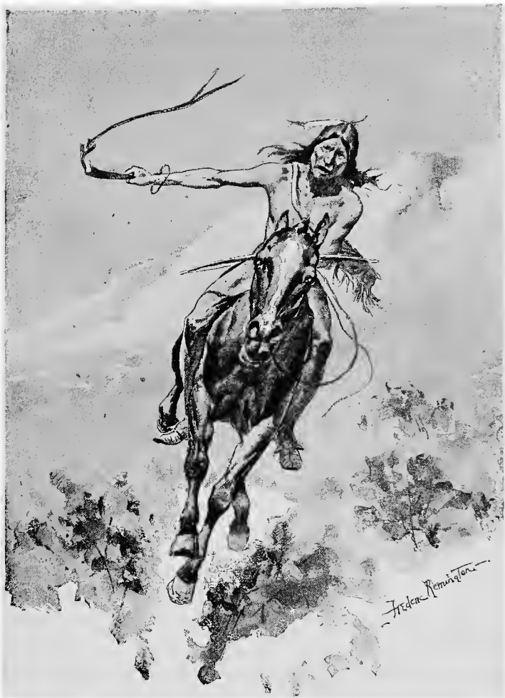
THE WAR WHOOP.