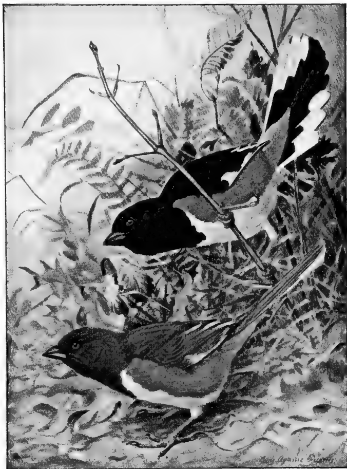
TOWHEE, OR CHEWINK Upper, male ; lower, female