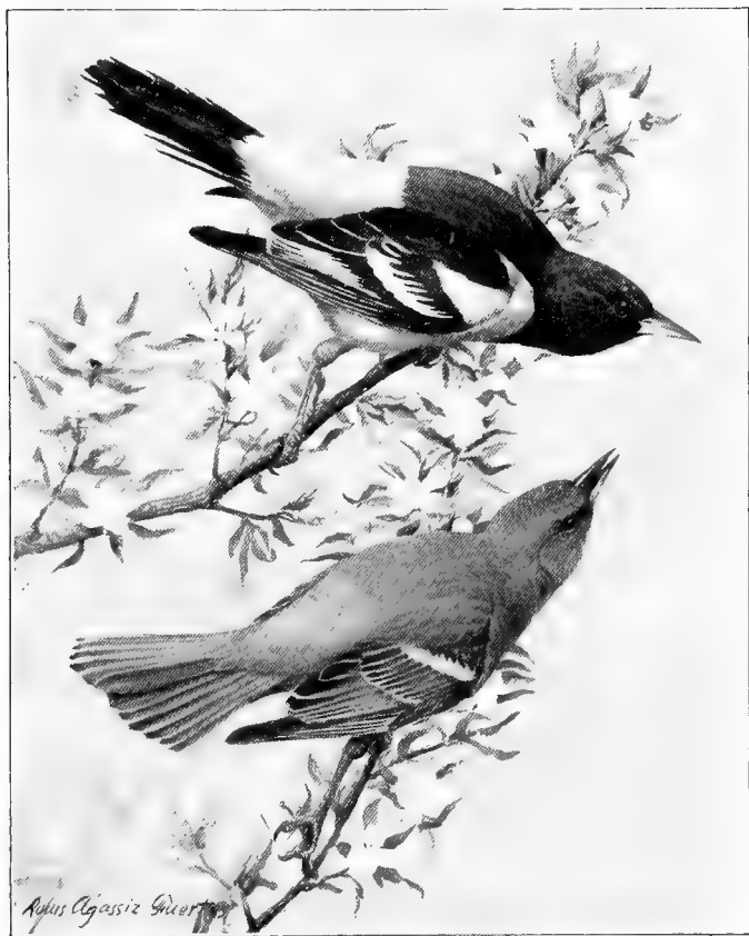
BALTIMORE ORIOLE Upper, male; lower, female