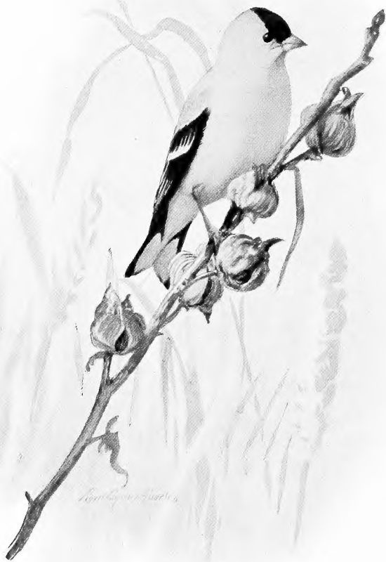
GOLDFINCH (page 125)