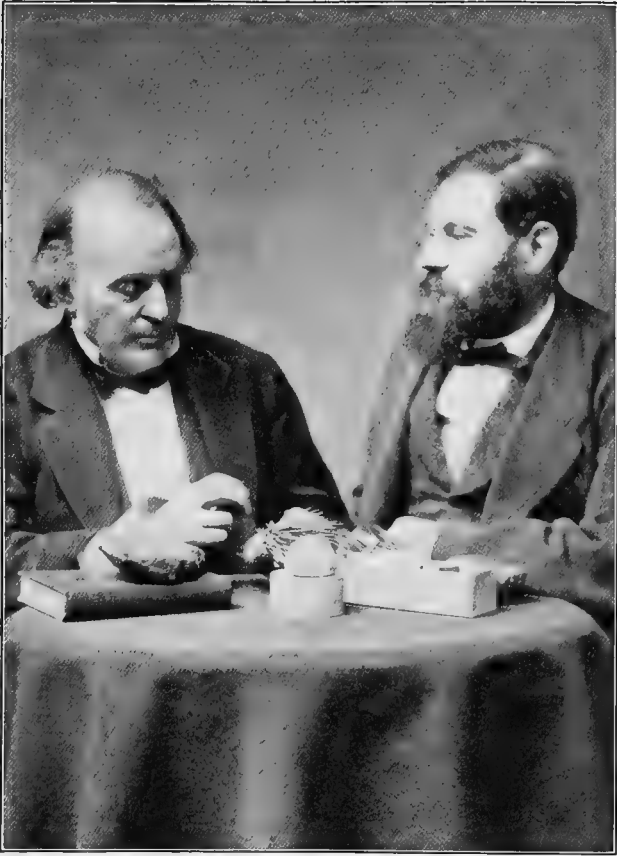
LOUIS AGASSIZ AND COUNT FRANÇOIS DE POURTALÈS