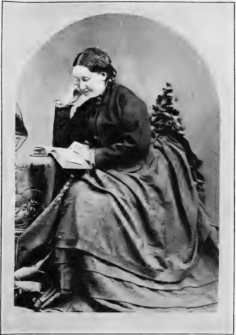
ELIZABETH CARY AGASSIZ 1872