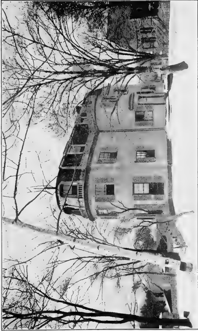
THE FAY HOUSE IN 1887