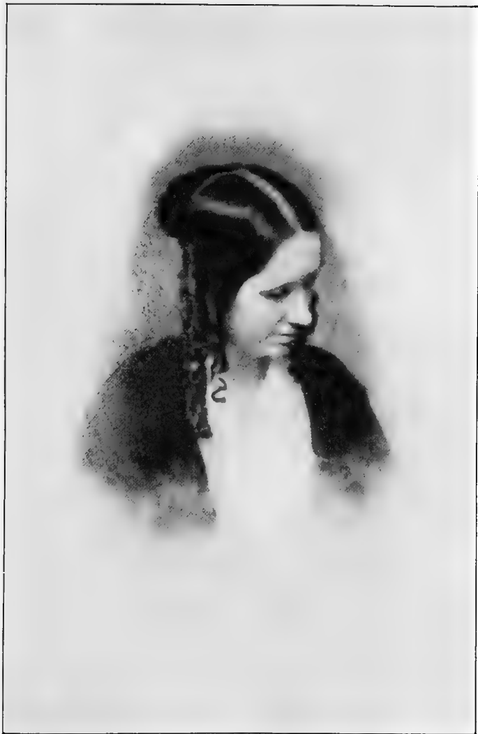
ELIZABETH CARY AGASSIZ