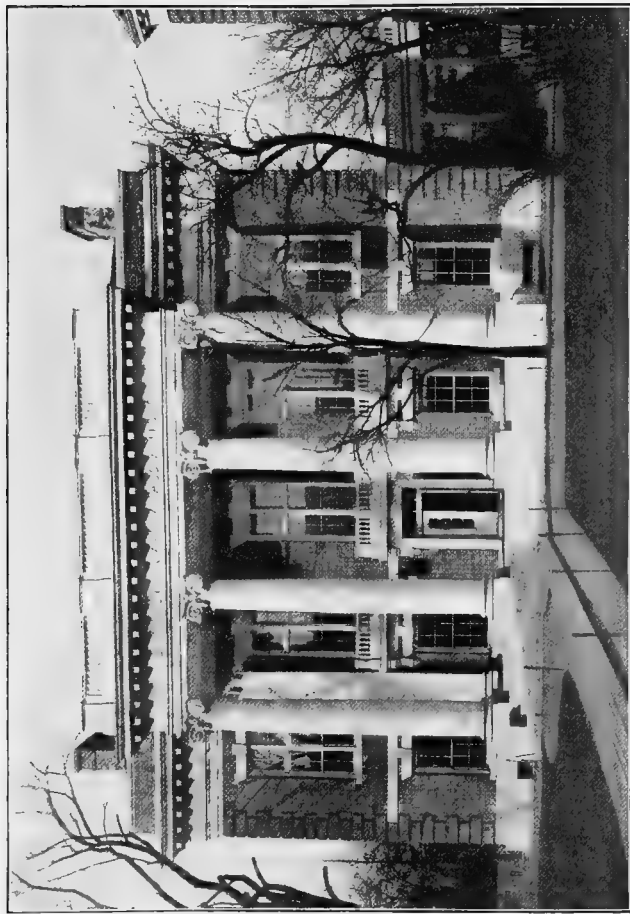
ELIZABETH CARY AGASSIZ HOUSE, RADCLIFFE COLLEGE