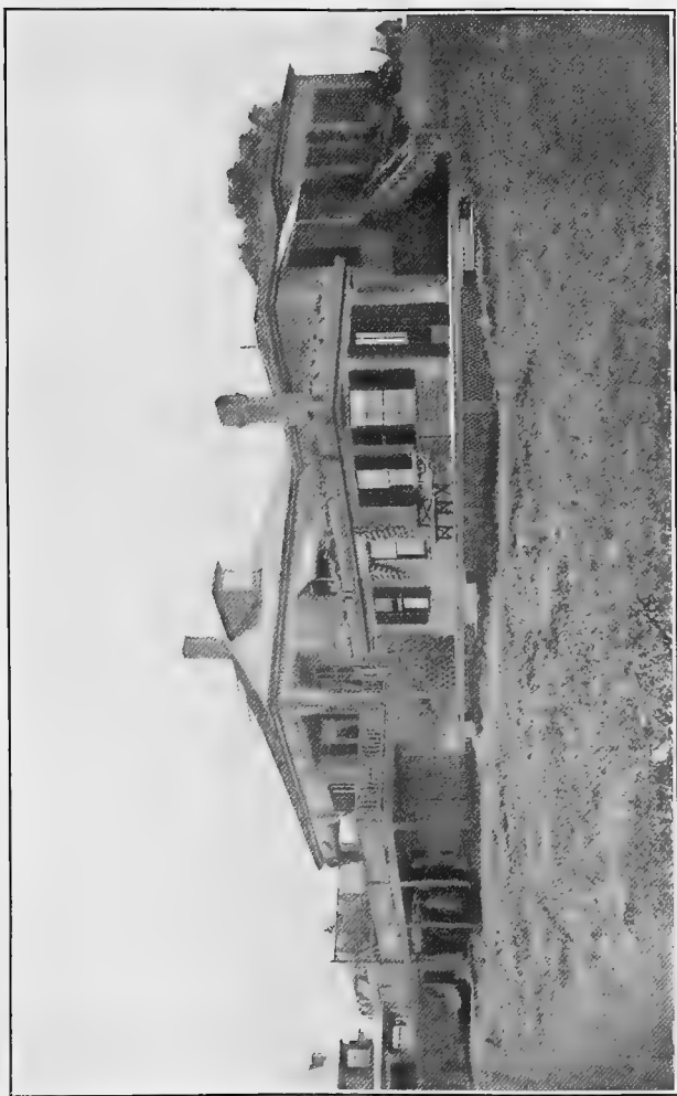
THE AGASSIZ HOUSE AT NAHANT