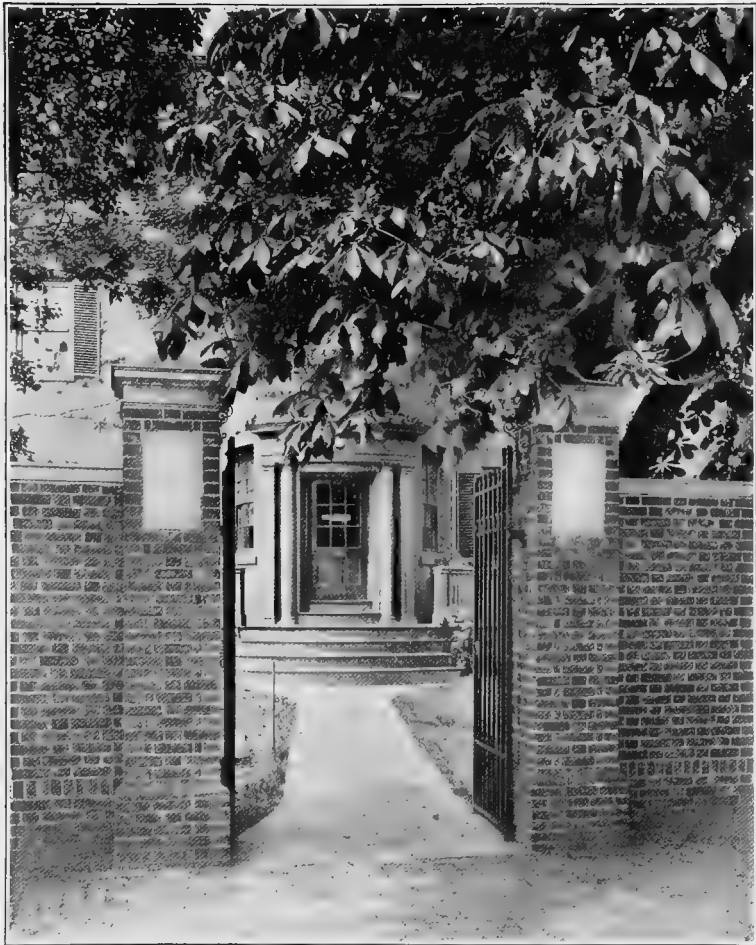
THE AGASSIZ GATE, RADCLIFFE COLLEGE