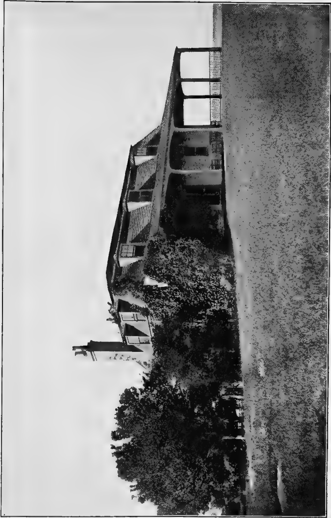
THE CARY COTTAGE AT NAHANT