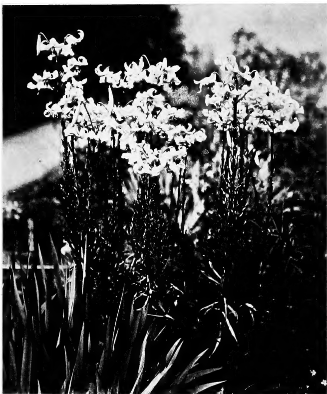
Lilium Testaceum in the Botanic Garden, Oxford.