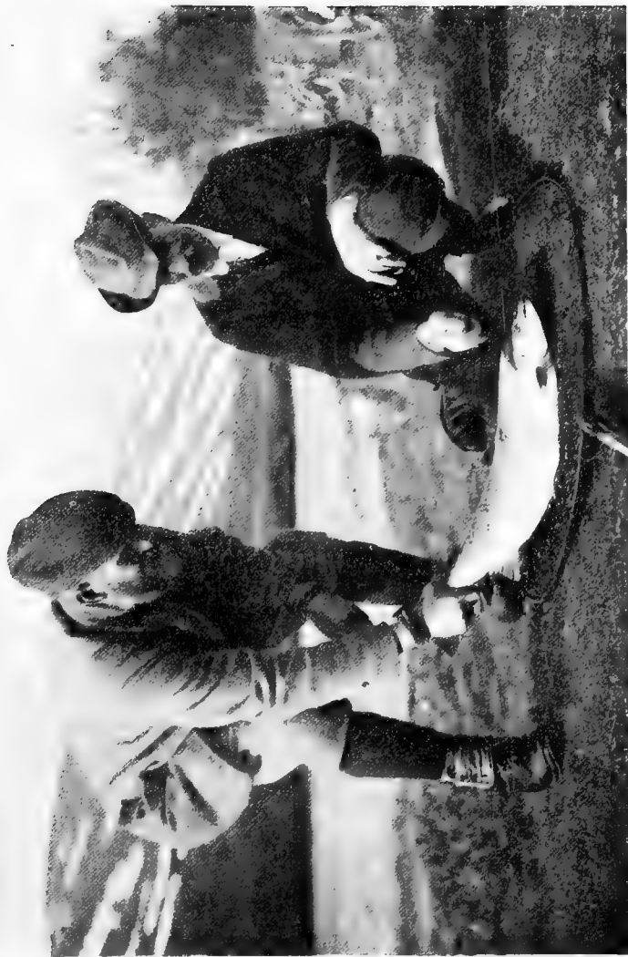
FEBRUARY ON THE HELMSDALE