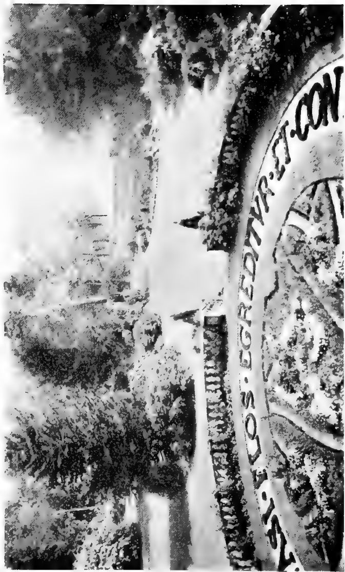
GARDEN VIEW AT MONREITH