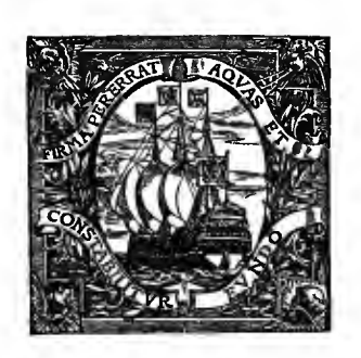
EDINBURGH T. & A. CONSTABLE Printers to Her Majesty 1893