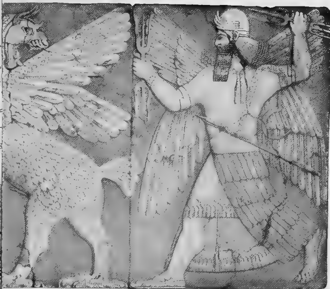
COMBAT OF A BABYLONIAN GOD WITH A MONSTER (p. 131).