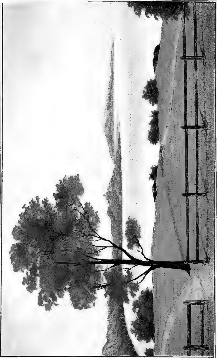
ANCOLA & GOKERN HEADLANDS.