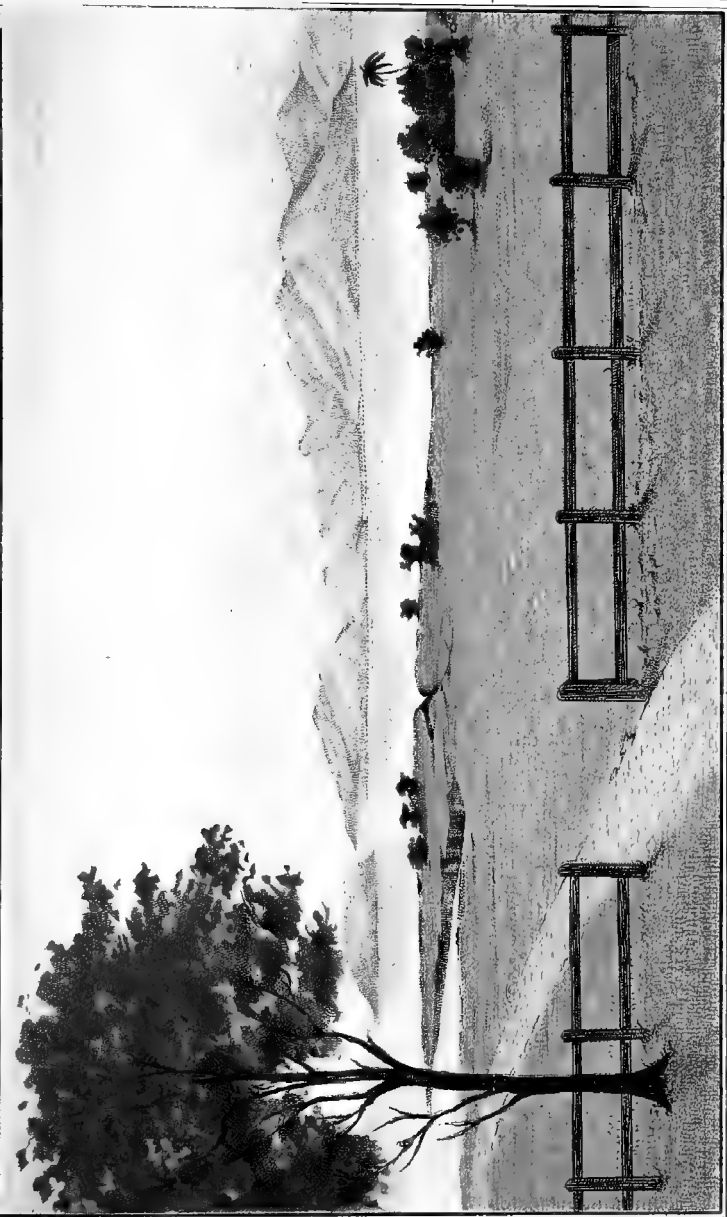
BAY OF BELIKERI.