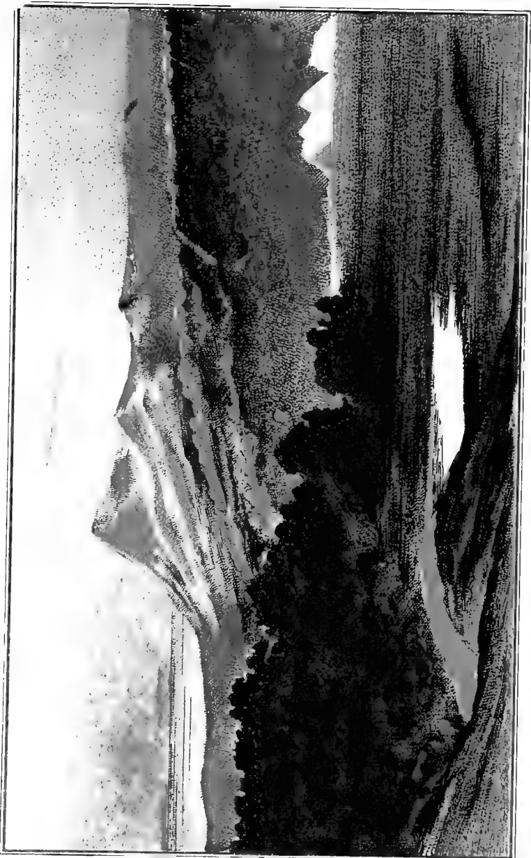
ENCAMPMENT AT NEELECOOND