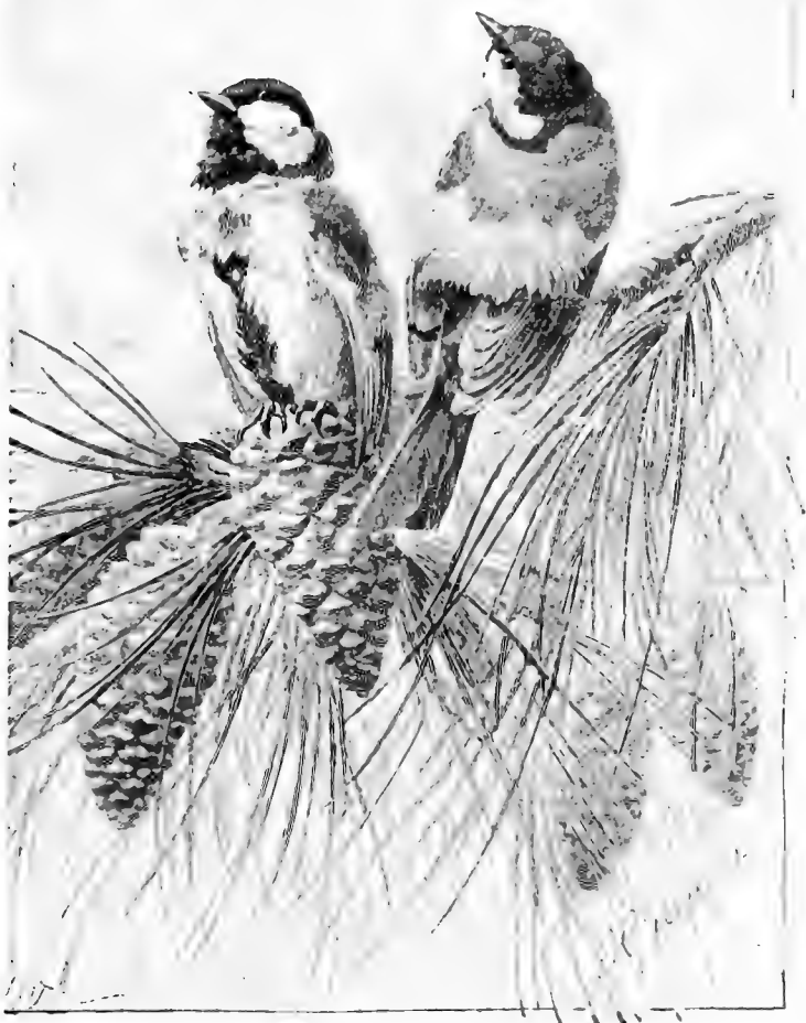
"THIS ATOM IN FULL BREATH."