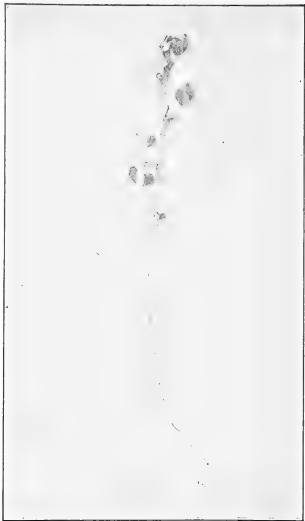
Fig. 8. Japan Clover ( Lespedeza striata )