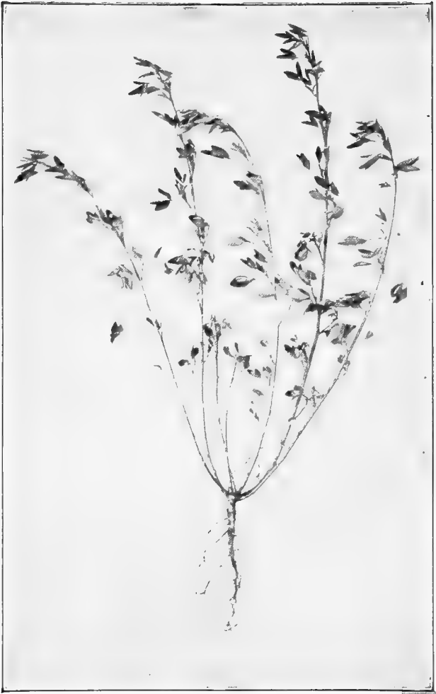
Fig. 9. Sweet Clover ( Melilotus alba )