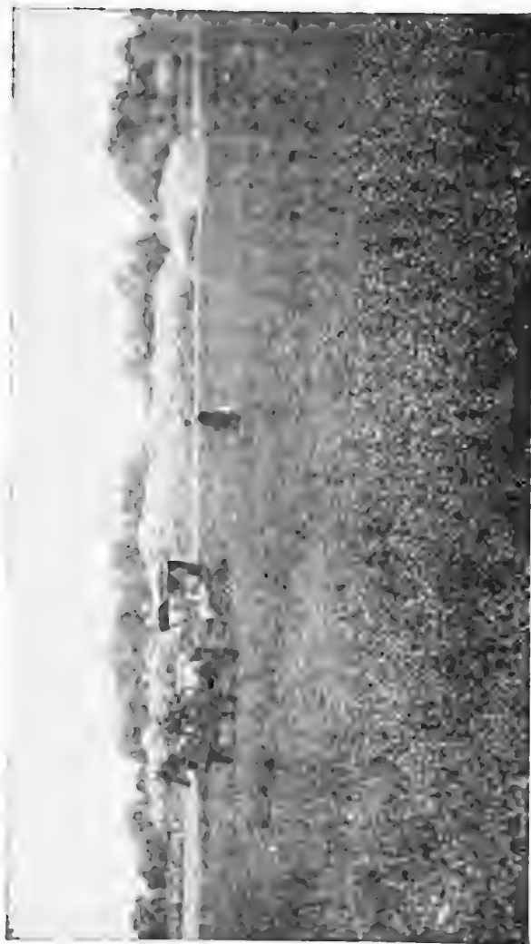
Fig. 4. Field of Alfalfa in California