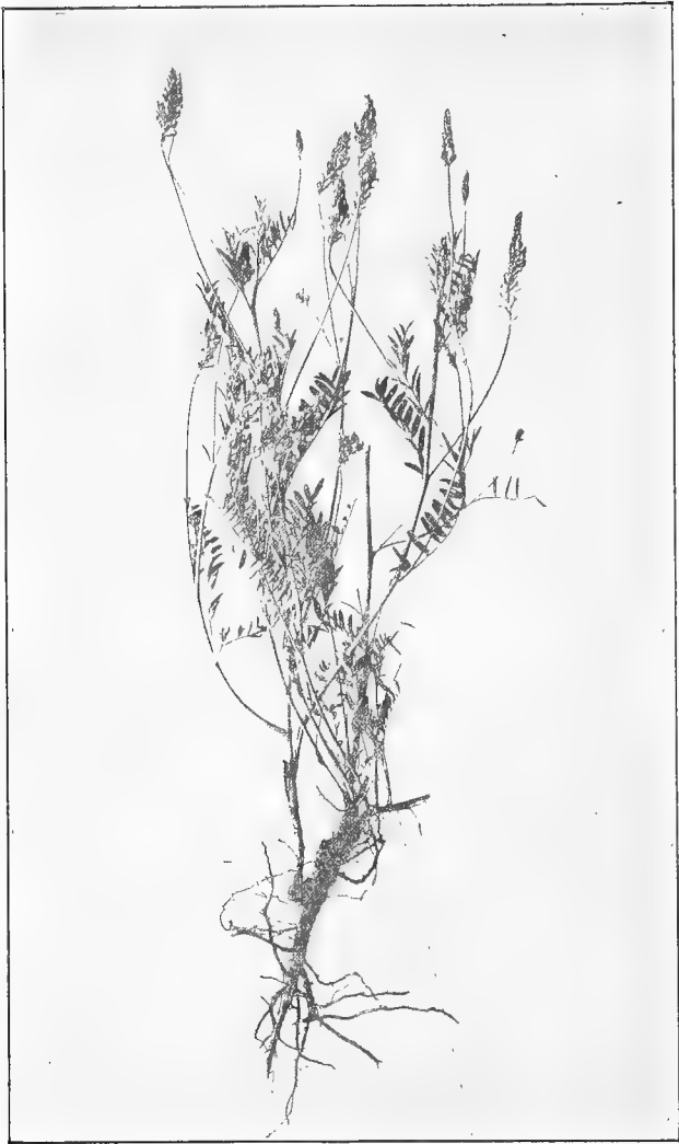
Fig. 10. Sainfoin ( Onobrychis sativa )