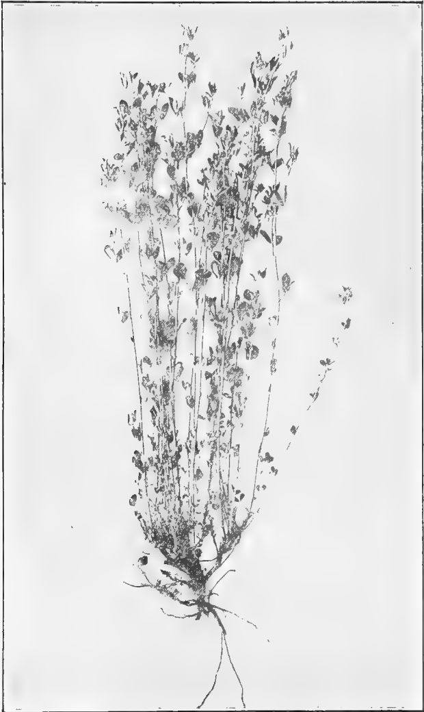
Fig. 3. Alfalfa ( Medicago sativa )