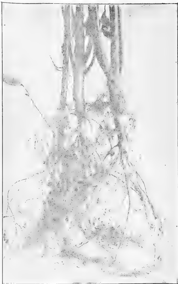
Fig. 12. Beggar Weed ( Desmodium tortuosum ) (Root System)