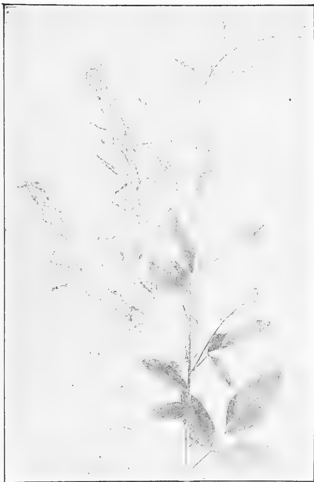
Fig. 11. Beggar Weed or Florida Clover ( Desmodium tortuosum ) (Flower and Seed Stems)