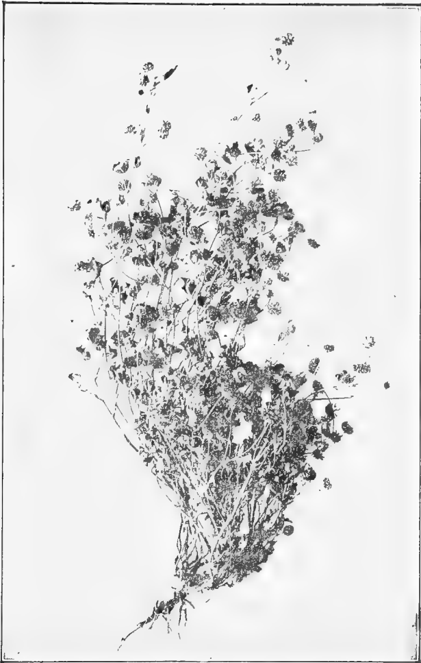
Fig. 5. Alsike Clover ( Trifolium hybridum )