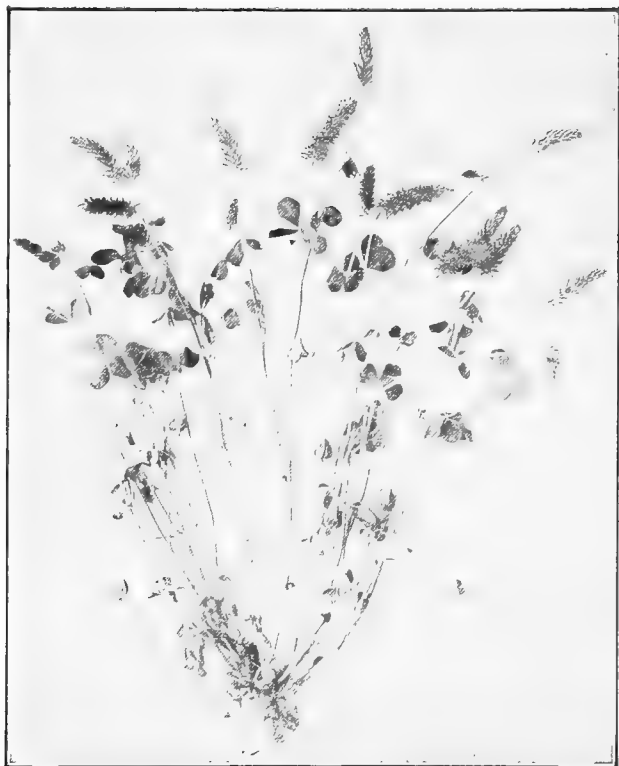
Fig. 6. Crimson Clover ( Trifolium incarnatum )