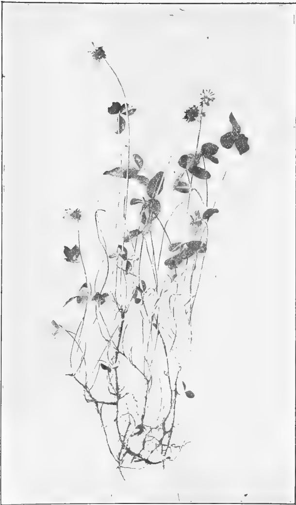
Fig. 7. White Clover ( Trifolium repens )