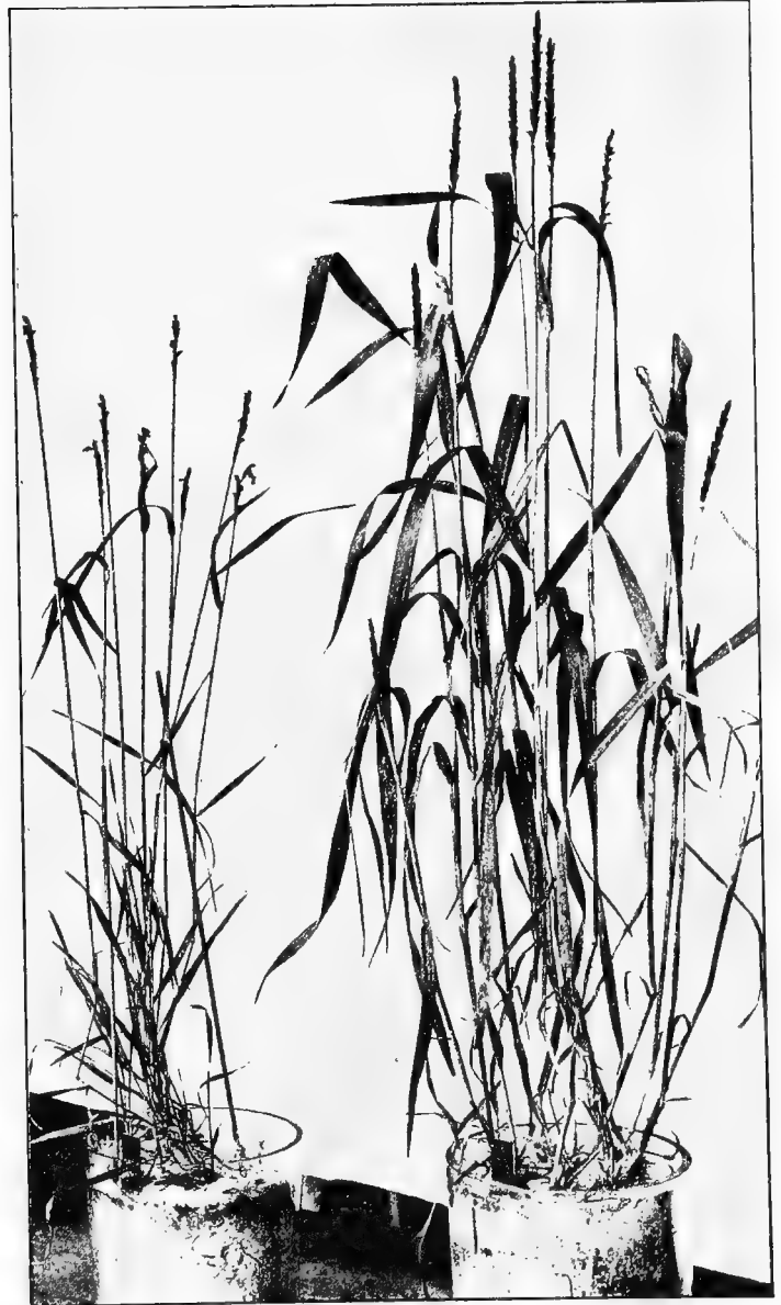
Completely Smutted Experimental Pots of Sugar Millet and Wheat with and without the Addition of Combined Nitrogen.