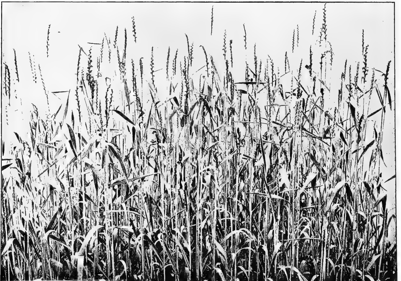
Fields of Barley and Wheat grown from Sterilized Seed inoculated when in Blossom.