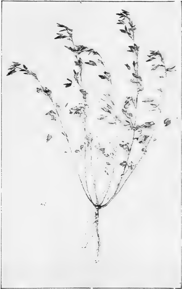
Fig. 9. Sweet Clover ( Melilotus alba )