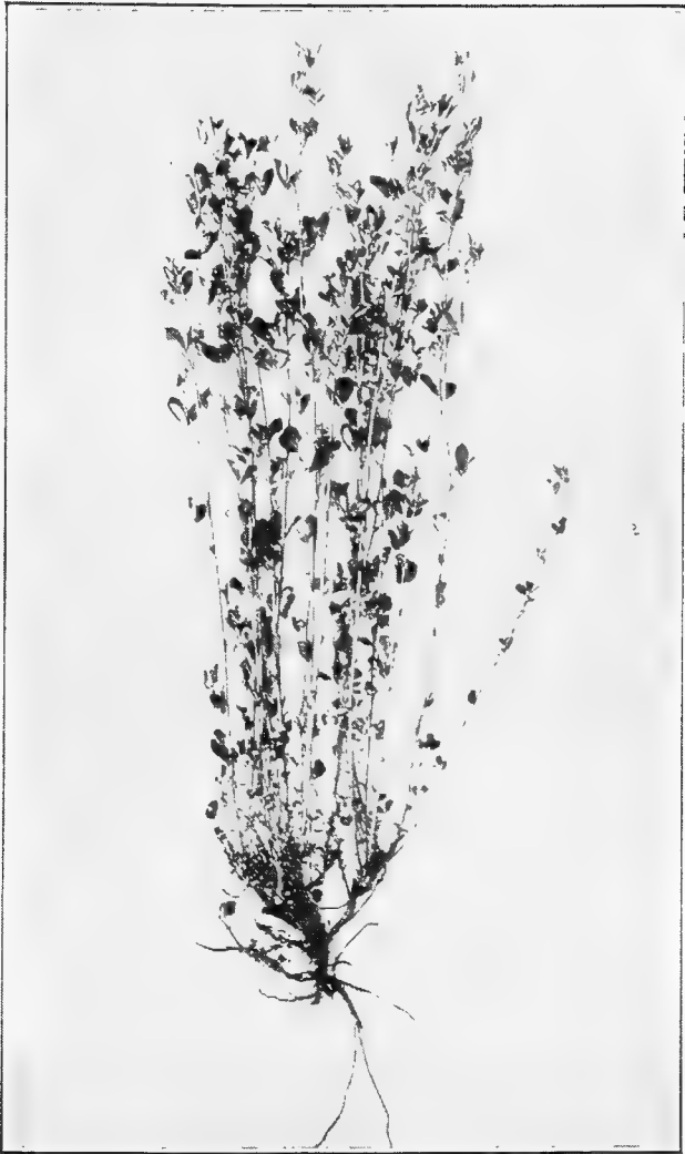
Fig. 3. Alfalfa ( Medicago sativa )