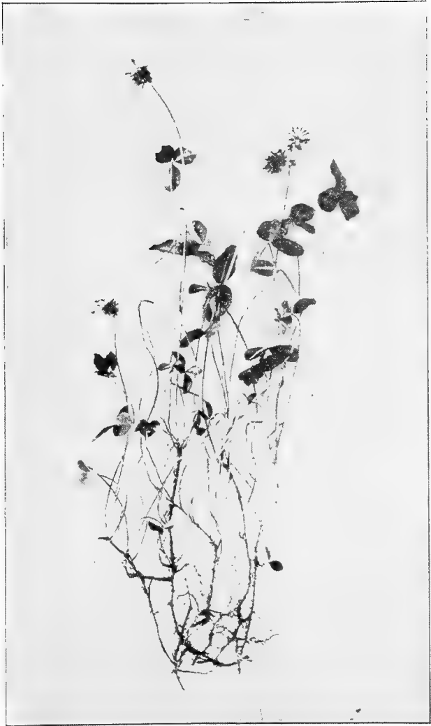
Fig. 7. White Clover .( Trifolium repens )