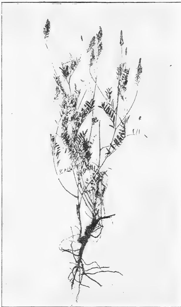
Fig. 10. Sainfoin ( Onobrychis sativa )