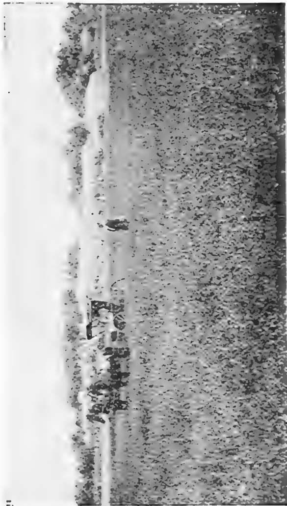
Fig. 4. Field of Alfalfa in California