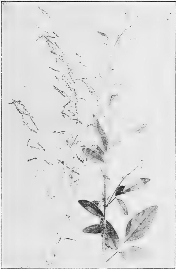
Fig. 11. Beggar Weed or Florida Clover ( Desmodium tortuosum ) (Flower and Seed Stems)