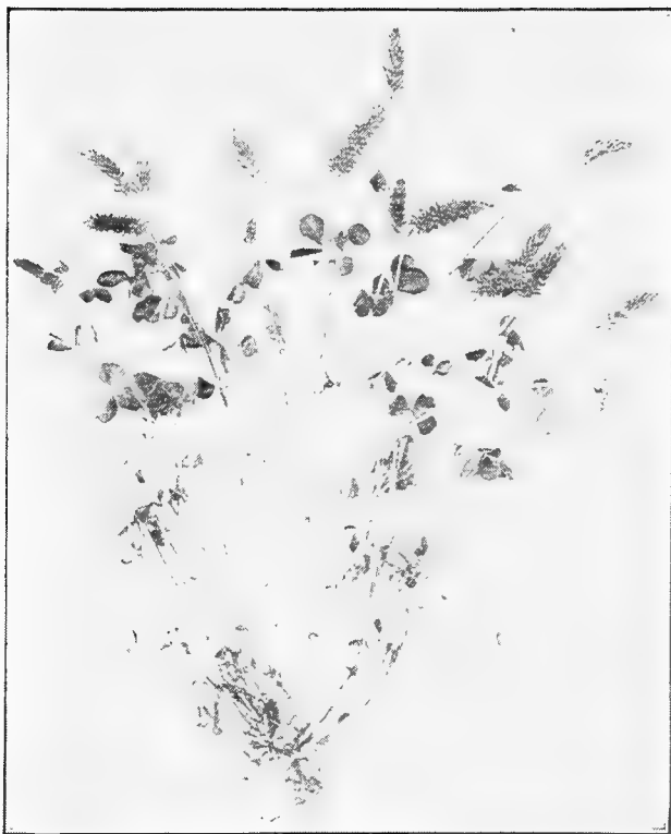
Fig. 6. Crimson Clover ( Trifolium incarnatum )