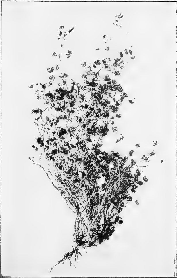
Fig. 5. Alsike Clover ( Trifolium hybridum )