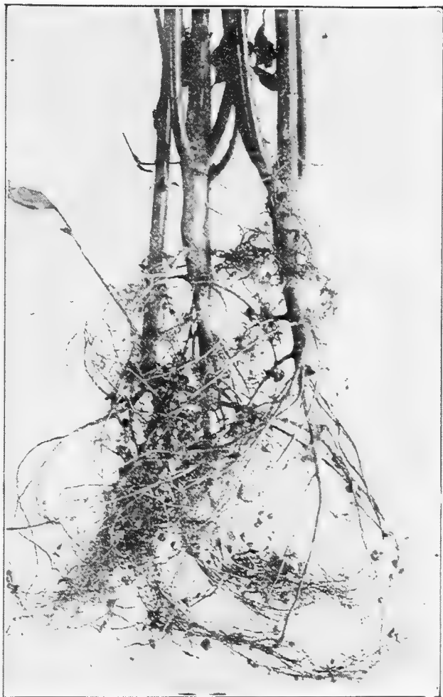
Fig. 12. Beggar Weed ( Desmodium tortuosum ) (Root System)