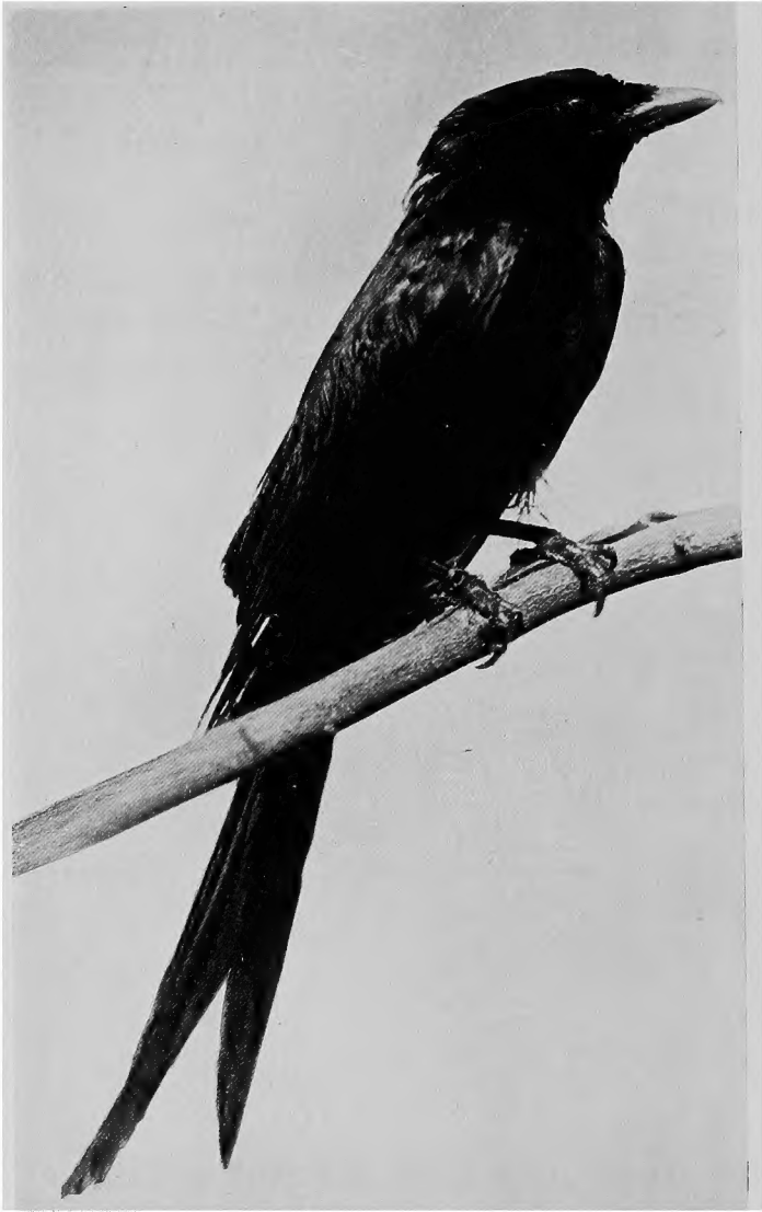
THE KING CROW