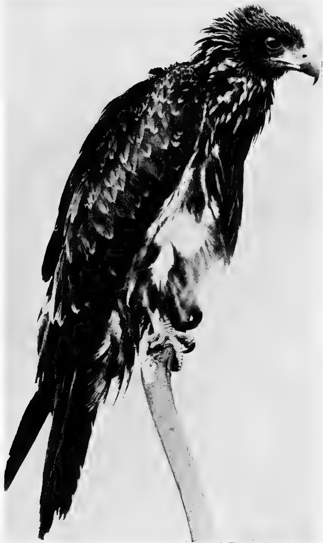
THE PARIAH KITE