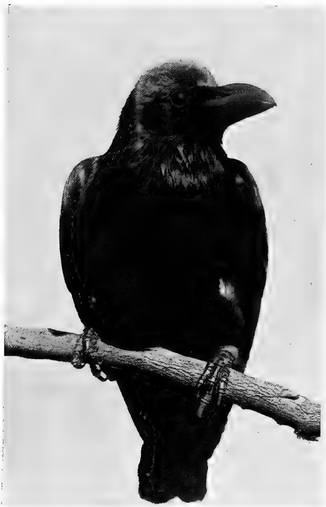
THE INDIAN CORBY