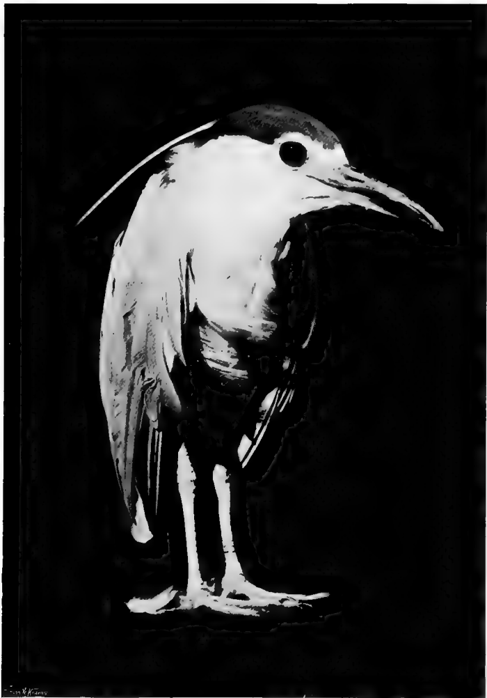
THE NIGHT HERON