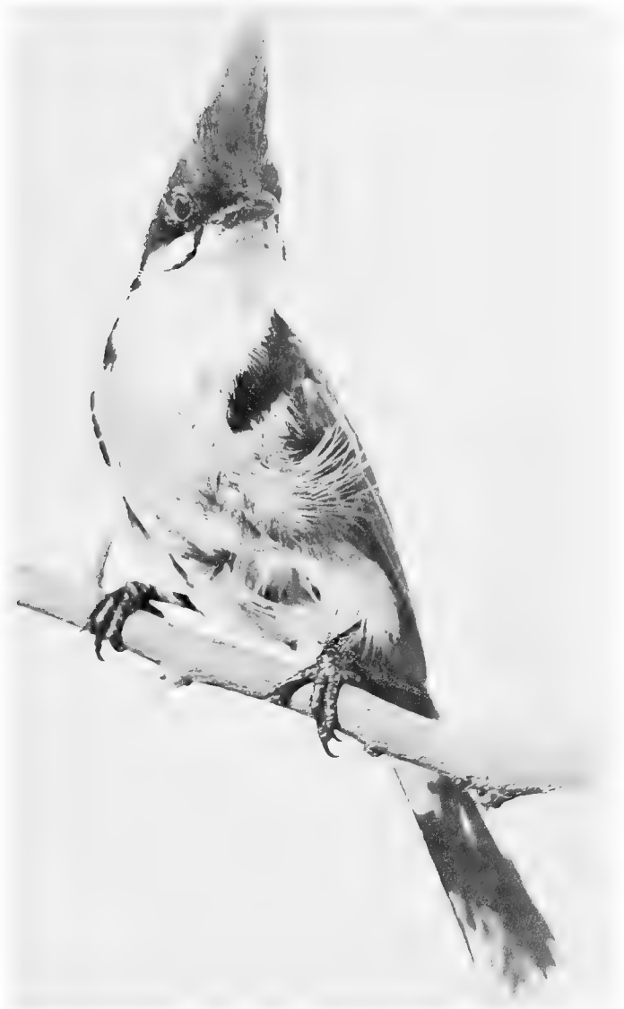
RED WHISKERED BULBUL