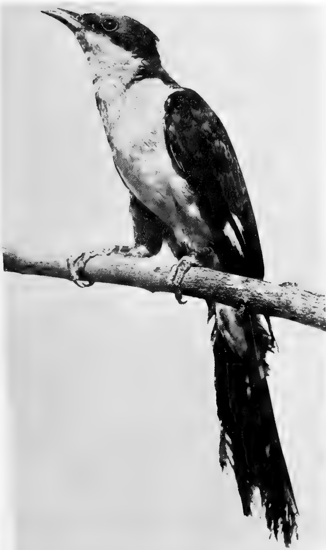
THE LARGE CRESTED CUCKOO ( COCCYTES GLANDARIUS )