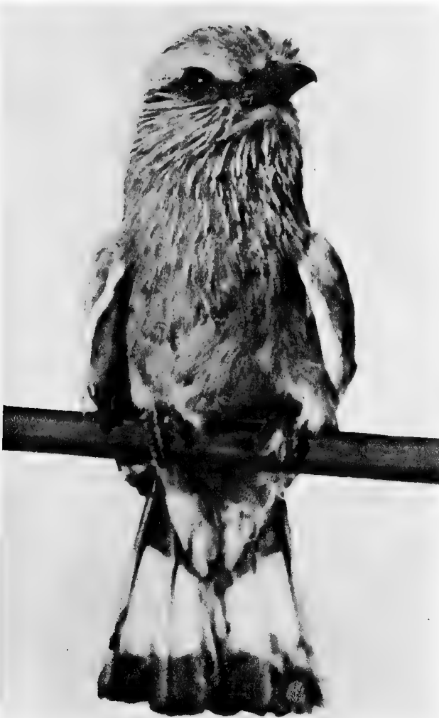
ROLLER-BIRD OR "BLUE JAY"