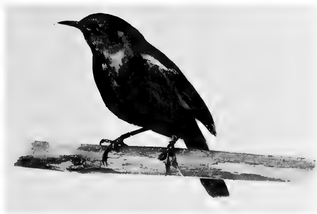
THE INDIAN ROBIN