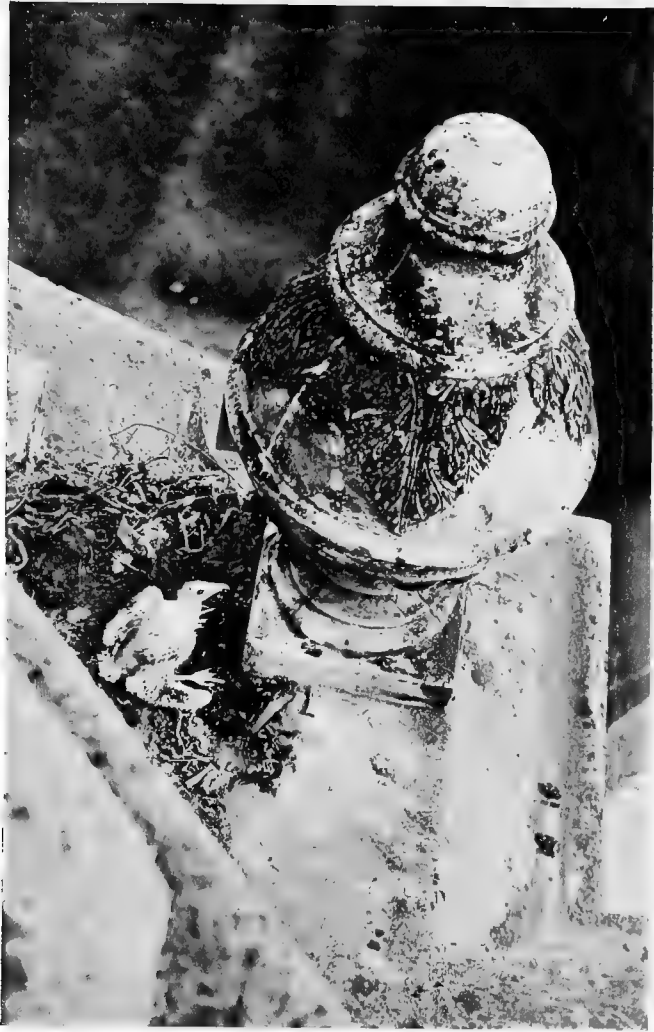
YOUNG SCAVENGER VULTURE IN NEST