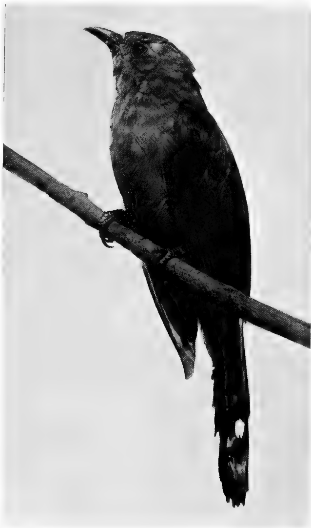
PLAINITIVE CUCKOO ( CUCOMANTIS PASSERINUS )