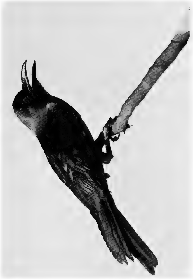
INDIAN HOUSE CROW