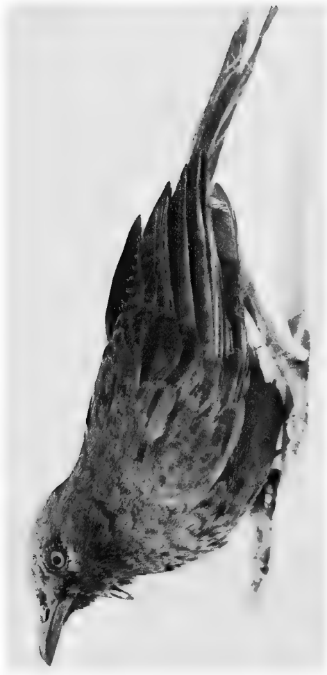
THE BABBLER (ONE OF THE SEVEN SISTERS)