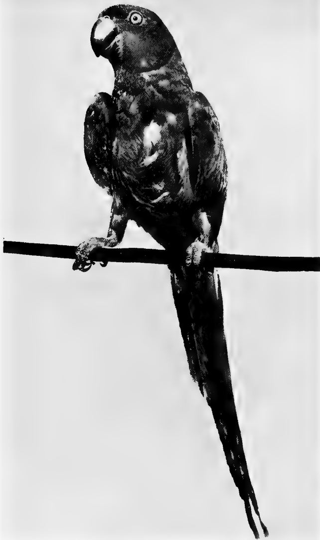
THE ROSE-RINGED PARAKEET