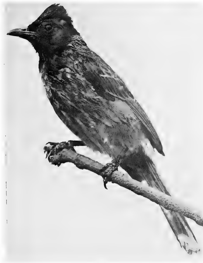
BULBUL. (RED VENTED)