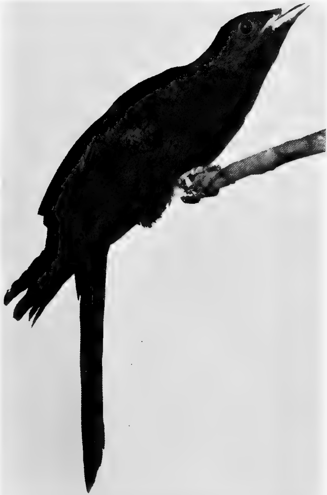
THE KOEL, OR BLACK CUCKOO, MALE