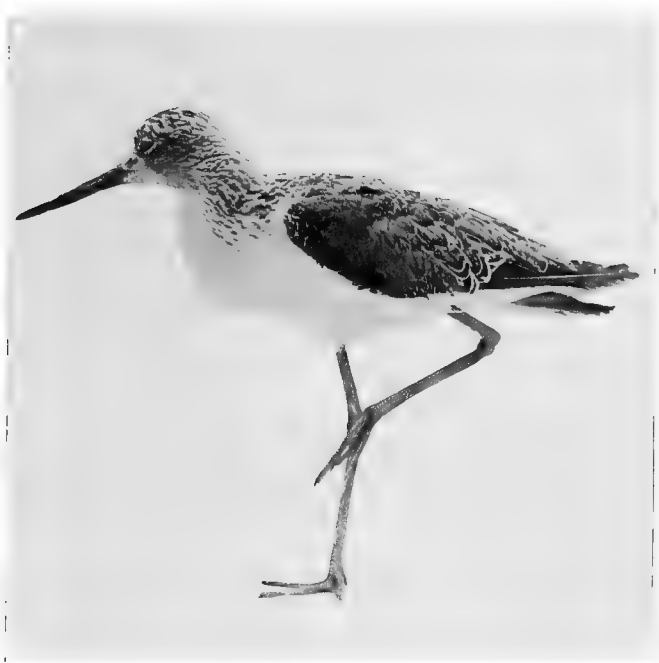
GREEN SHANK (ONE OF THE KUCH NÉS OF THE INDIAN SHIKARI)