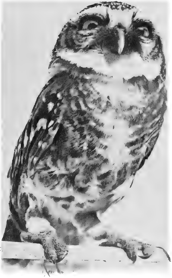
THE SPOTIED OWLET