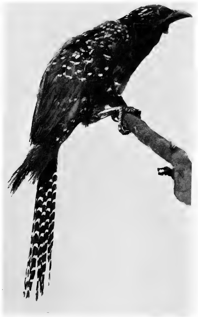
THE KOEI, OR BLACK CUCKOO, FEMALE