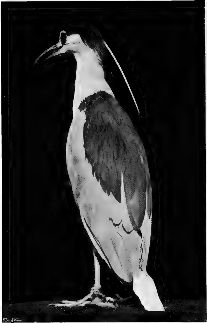
THE NIGHT HERON