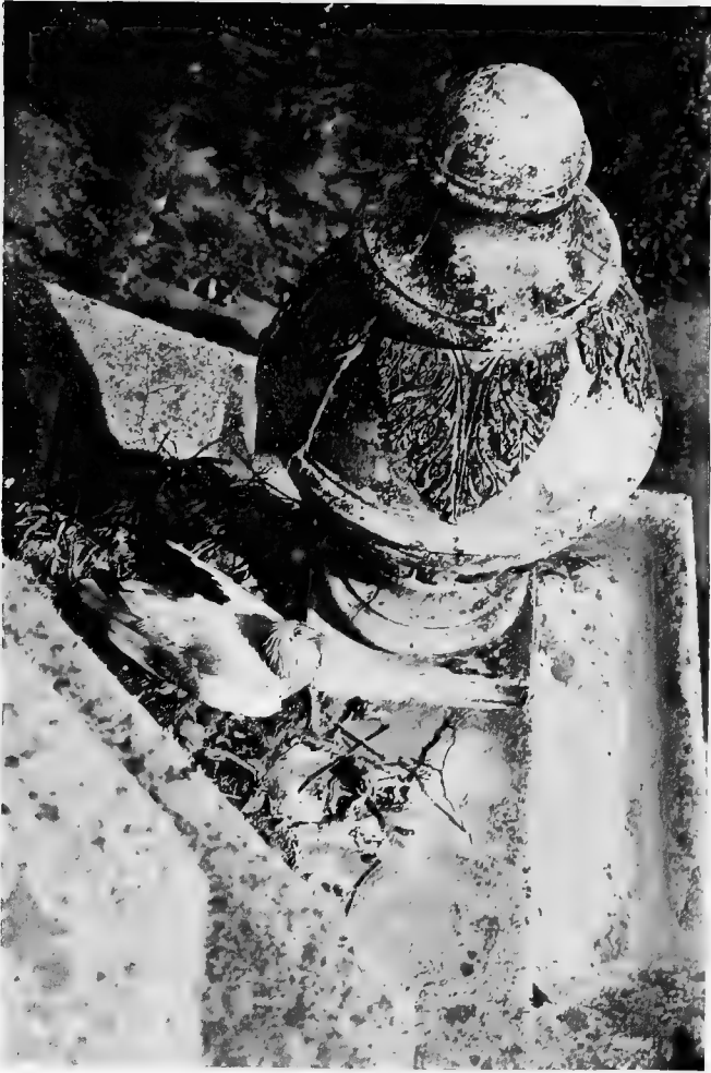
SCAVENGER VULTURE ON NEST