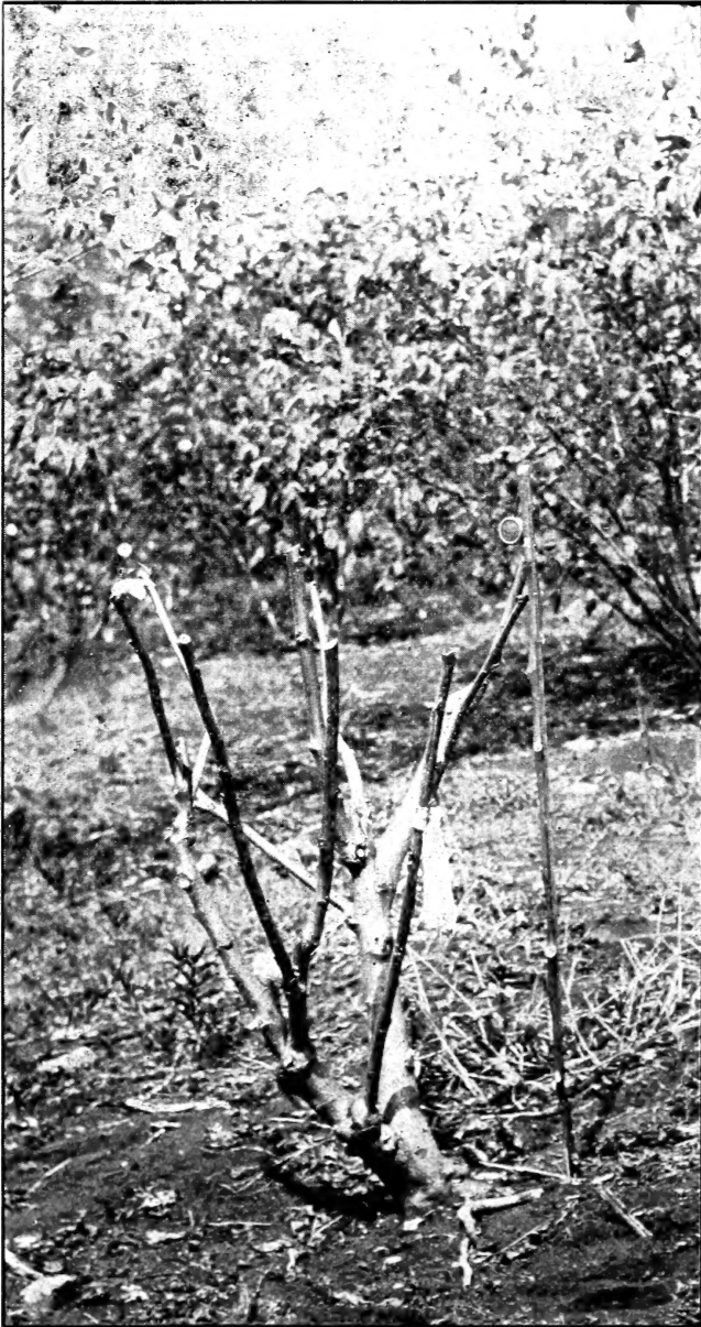
Cotton Plant Properly Pruned.