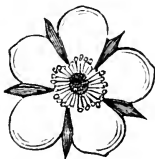
Staminate or Male Blossom.