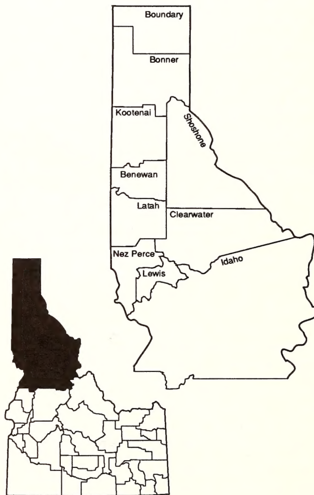
Figure 1—Northern Idaho counties.

The field locations selected for measurement during the forest survey of northern Idaho (fig. 1) were taken from a 5,000-m grid distributed across the State. Only privately owned forest lands were sampled, and a portion of the resource information from those lands is reported here. In total, some 700 field locations were visited, and 426, which were permanently established, were found to contain sufficient stocking to qualify as forest. On the forested locations, sample trees were selected using both fixed-radius and variable-radius plots on each point of a 5-point cluster. For trees under 5.0 inches diameter at breast height (d.b.h.) a 1/300 -acre fixed-area plot was used. Trees 5.0 inches and larger d.b.h. were selected on a variable-radius plot using a 40 basal area factor prism.