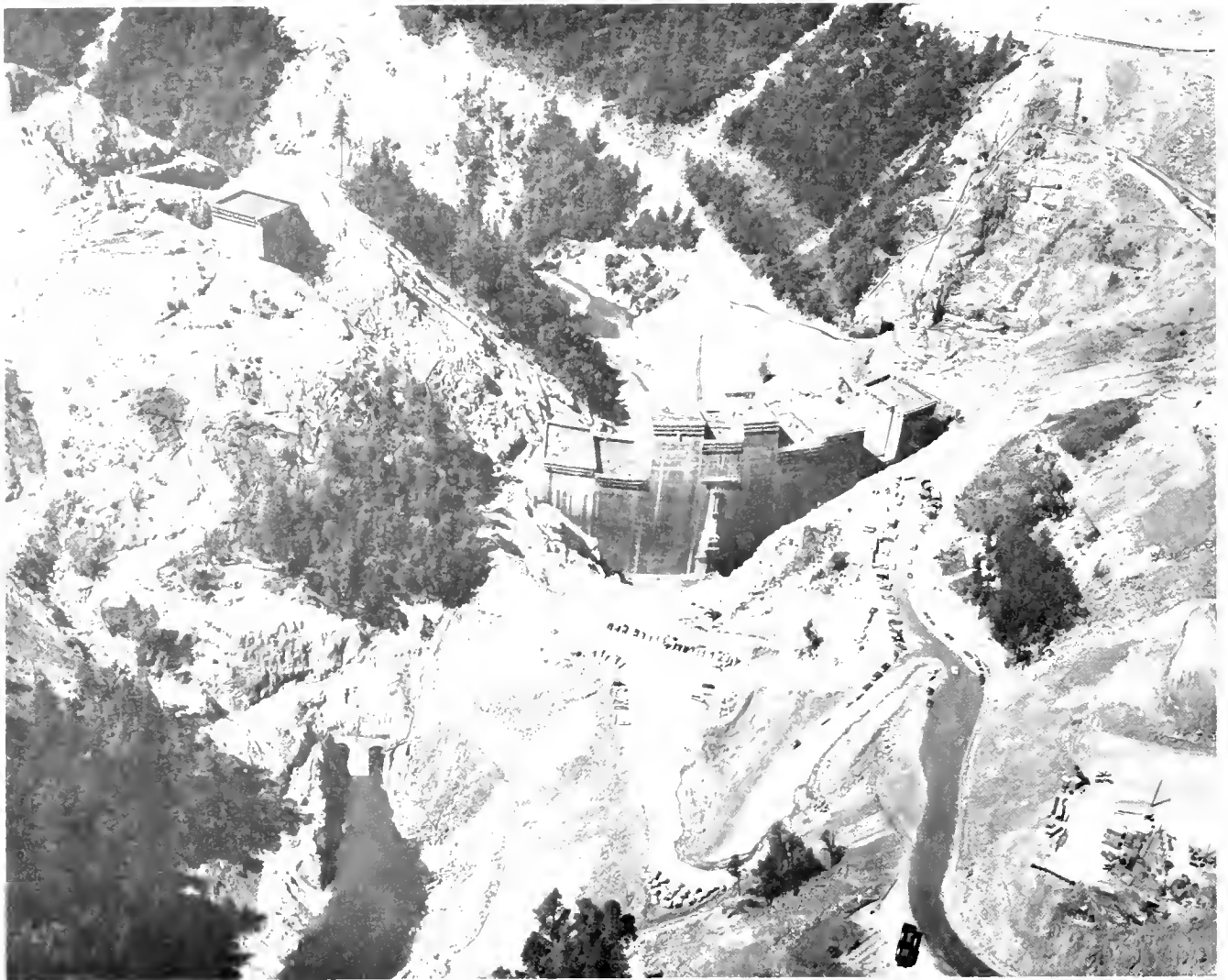
Aerial view looking downstream at construction of New Bullards Bar dam on the North Yuba River. The height of the block shown in the central portion of the arch is 300 feet above the streambed. The completed arch will rise 635 feet above streambed and impound 930,000 acre-feet of water.