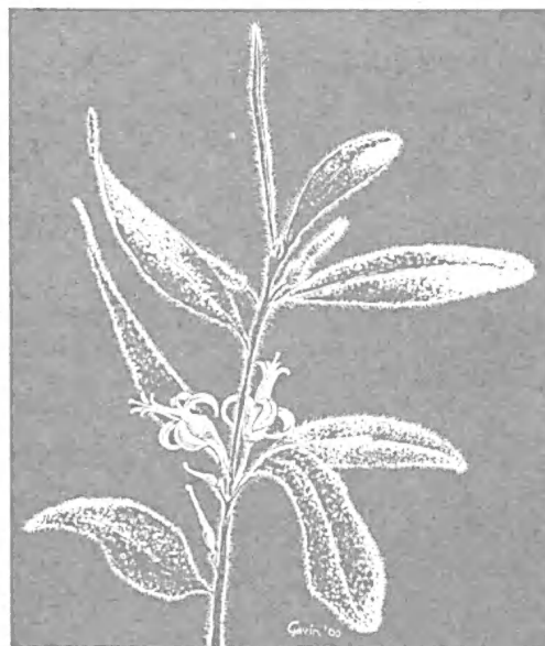
Persoonia mollis subsp. maxima . Illustration: Gavin Gatenby

Email: christopher.lacey@npws.nsw.gov.au