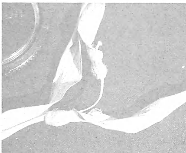
Inflorescence of Coix gasteenii showing leaf-like structure.

With so little known about C. gasteenii and with such a small population, there are some clear imperatives for management. Firstly, it is necessary to secure the site from the impacts of grazing, weeds and fire until more is known about its requirements. Secondly, ex situ populations need to be established as a safeguard against loss of the wild population and to provide material for further study. Finally, further studies into the ecology and morphology of the plant will provide information essential for management and for predictive modelling of potential habitat