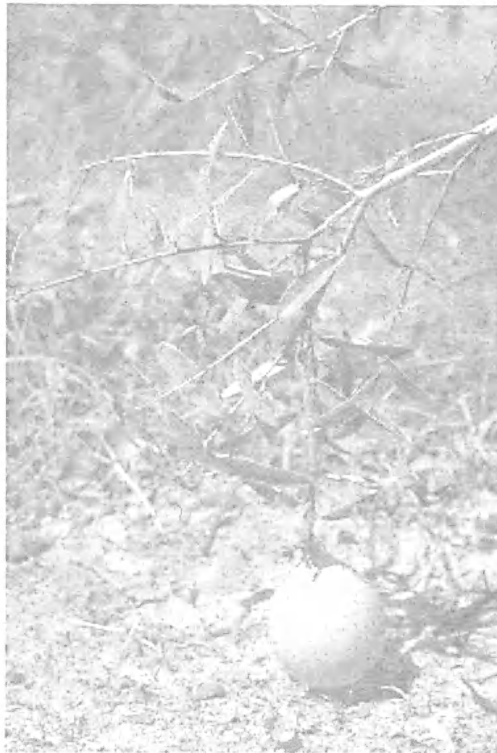
Jedda multicaulis

The grass Eremochloa muricata was collected from a rocky headland just south of Cape Flattery in 1976, but searches on similar headlands along the east coast of Cape York Peninsula over the past 20 years have failed to find it. This remains the only collection of this plant from Australia, although the species also occurs in India and Sri Lanka.