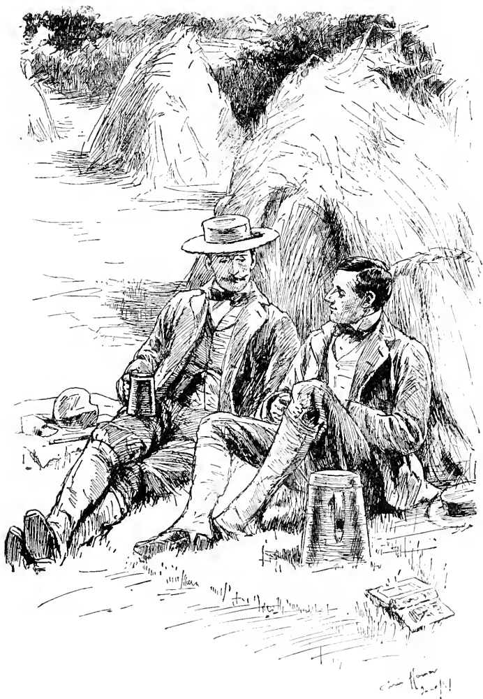
"Sprawling in the yellow stubble."