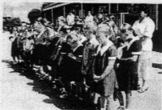
Students at school observing a minutes silence.

A special thank you must go to all community members who helped with the organisation of the Delungra Anzac service – it was much appreciated.