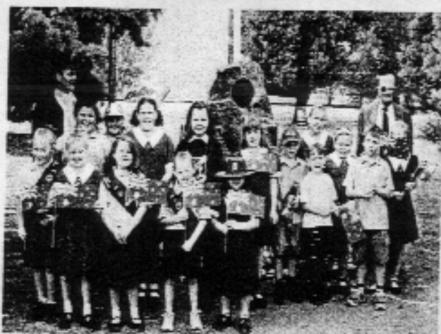
The community service.

A special thank you must go to all community members who helped with the organisation of the Delungra Anzac service – it was much appreciated.