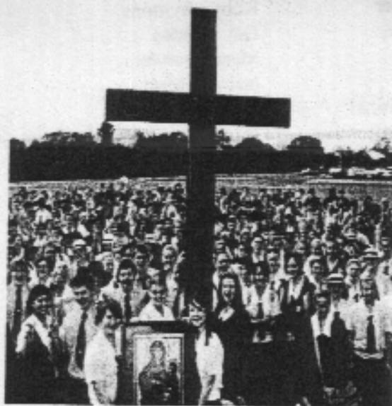
WYD Cross & Icon with school children in Brisbane