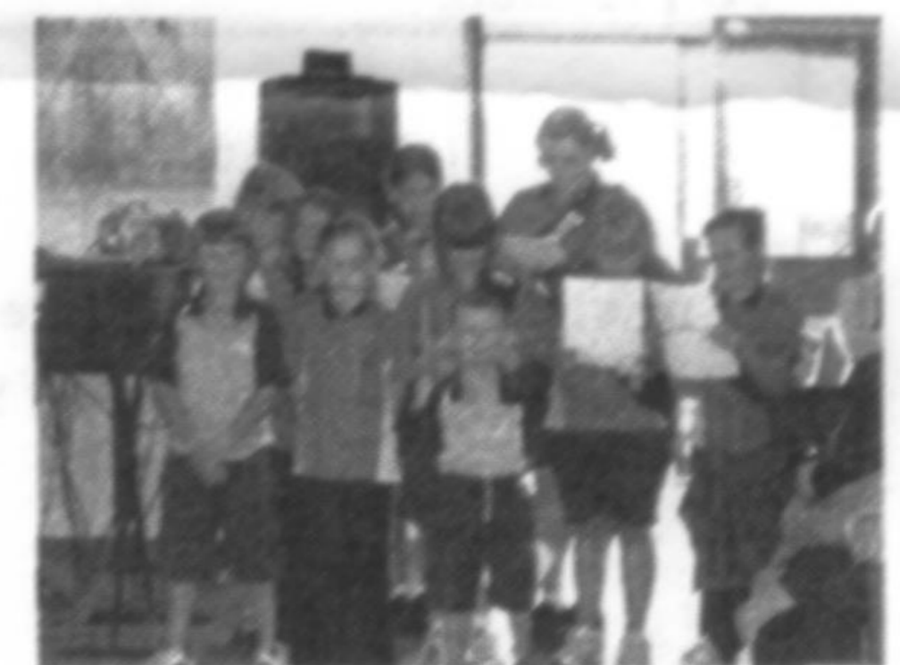
Delungra Girl Guides & Delungra Public School singing The Anzac