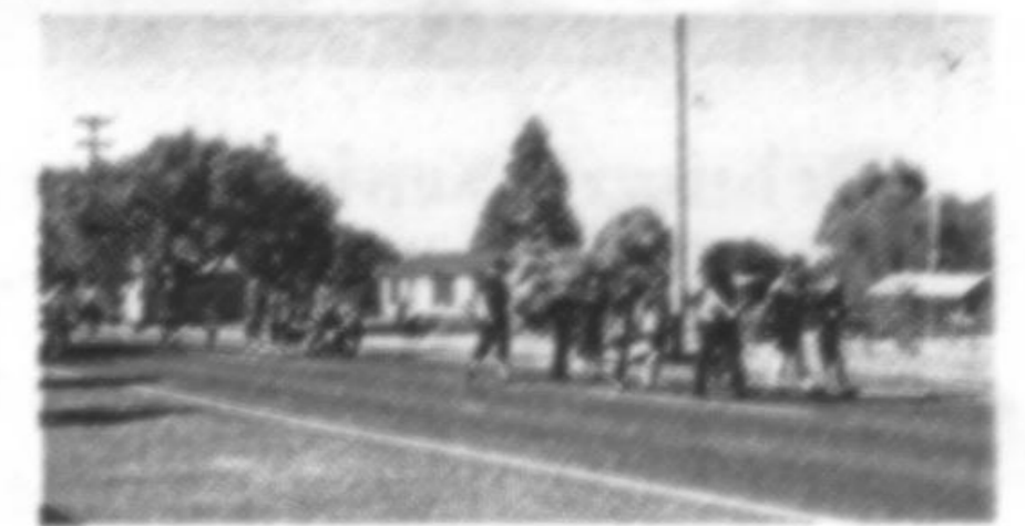
The Anzac March