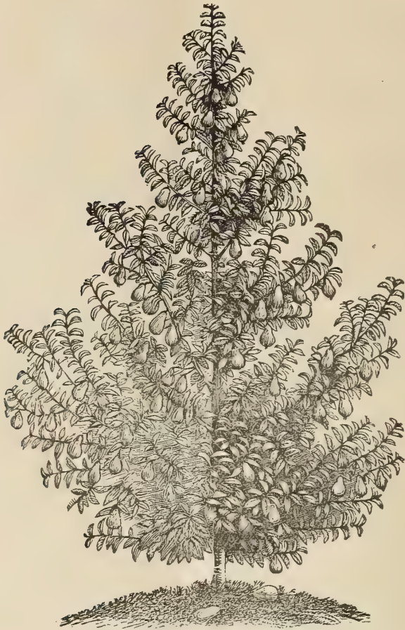
DWARF PEAR TREE.