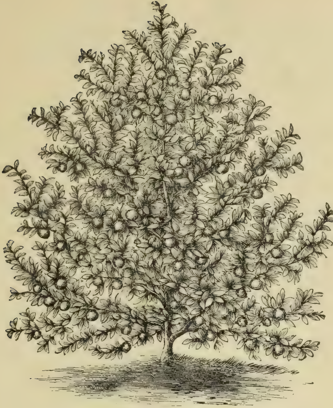
DWARF APPLE TREE.