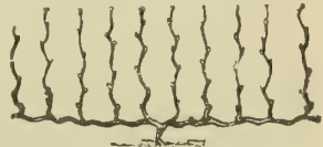
BEARING VINE BEFORE PRUNING.

The next pruning, which may be done in November or December, if it is desirable to lay the vines down and cover them over for the winter, or in February or March if not laid down, consists in cutting back all the young wood of the previous year's growth (except such shoots as may be required to extend the horizontal arms) to within one or two good bearing buds of the bearing canes on the lower wire, giving the vine the appearance of the following cut: