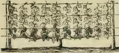
FRUITED GRAPE VINE.

first wire be 18 inches from the ground, and the distance between the wires about 12 inches. Wooden slats about one by two inches may be substituted for wires. Trellises should be at least 10 feet apart—a greater distance is preferable. Set the vines about 20 feet apart. Prune the vines to two canes each for two years after they are planted. In February or March these canes should be cut back to 5 or 6 feet each, and tied along the lower wire, or slat of the trellis, horizontally.