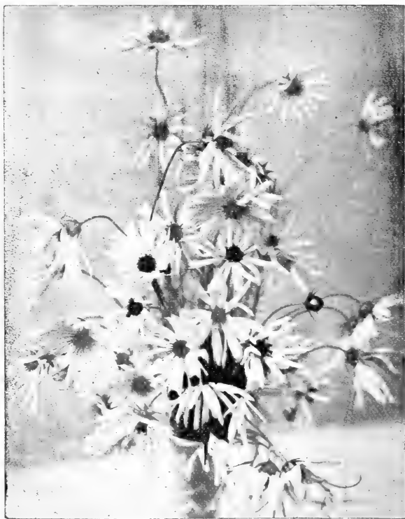
NEW MARGUERITE COSMOS.