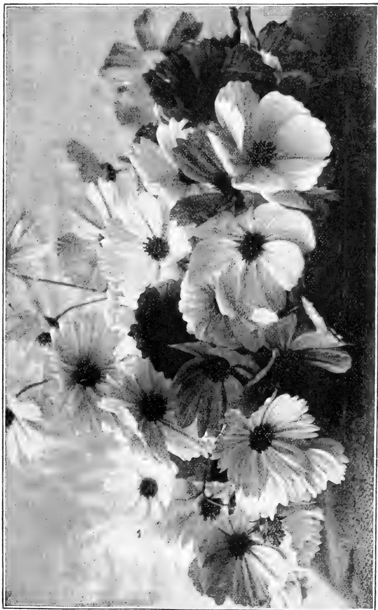
GROUP OF NEW FANCY COSMOS.