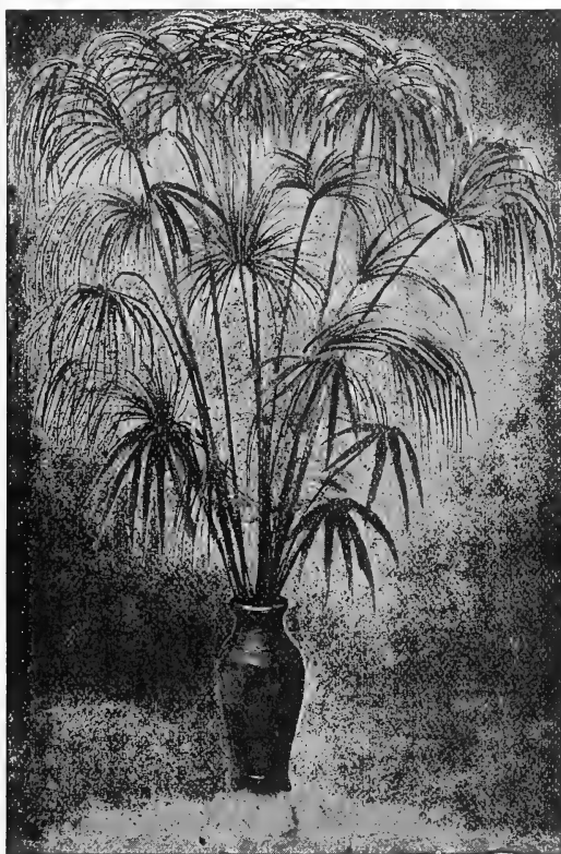
STEMS OF PAPYRUS.

Striped. Foliage green and white, stems yellow, with alternate sections of green up and down the stem. 75 cts.