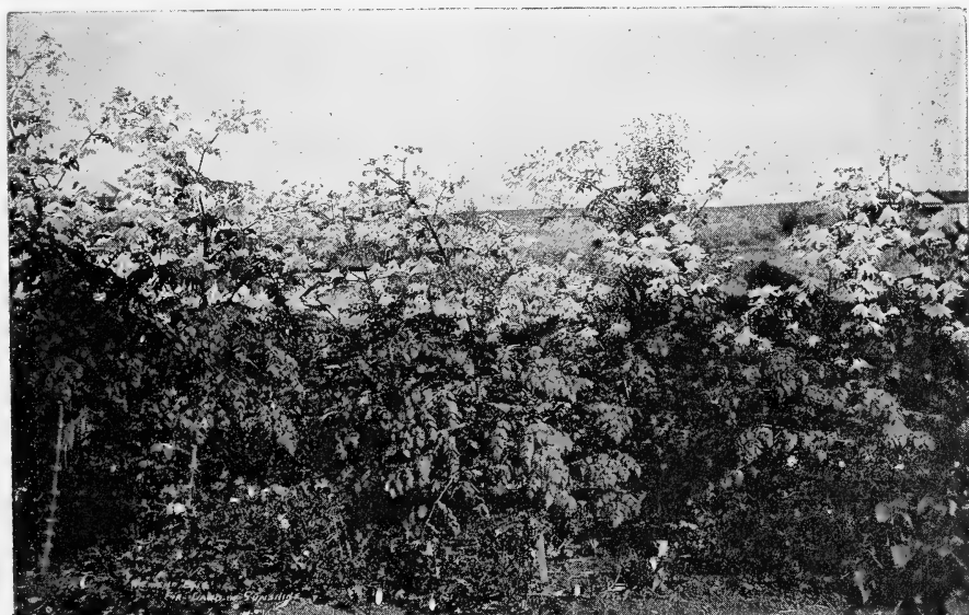
ROW OF DAHLIA IMPERIALIS.

D. Chinensis. Double and single, choice mixed. 5 cts. pkt.