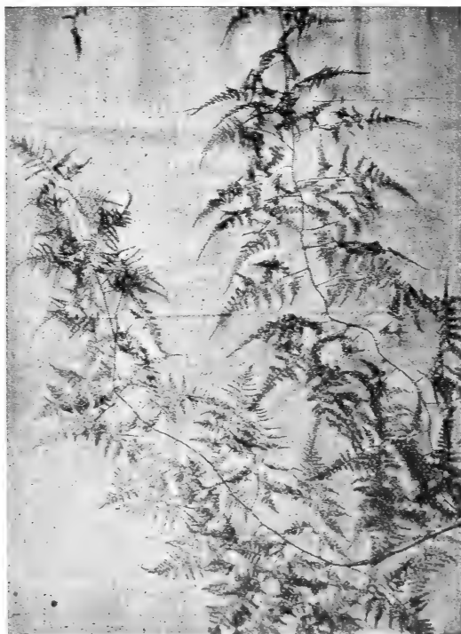
ASPARAGUS PLUMOSUS NANUS.

AMPELOPSIS Veitchii. Sometimes called "Boston Ivy" and "Japan Ivy." Entirely hardy in the most exposed places, attaining a height of 20 to 30 feet in two or three years, clinging to stones, brick or wood-work with the greatest tenacity. For covering dead trees, gate posts, boundary walls, etc., it has no equal. In the summer the foliage is a rich shade of green, but in the fall it assumes the most gorgeous tints of scarlet, crimson and orange, so dazzling as to be seen at a great distance. 15 to 50 cts.