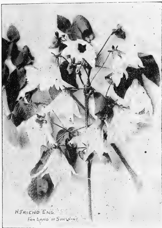
SPRAY OF DAHLIAS IMPERIALIS.

DAHPNE Odora Alba. This well-known and exquisitely scented white flowering shrub ought to be in every greenhouse. Same with rosy pink flowers and variegated foliage. 20 cts. each.