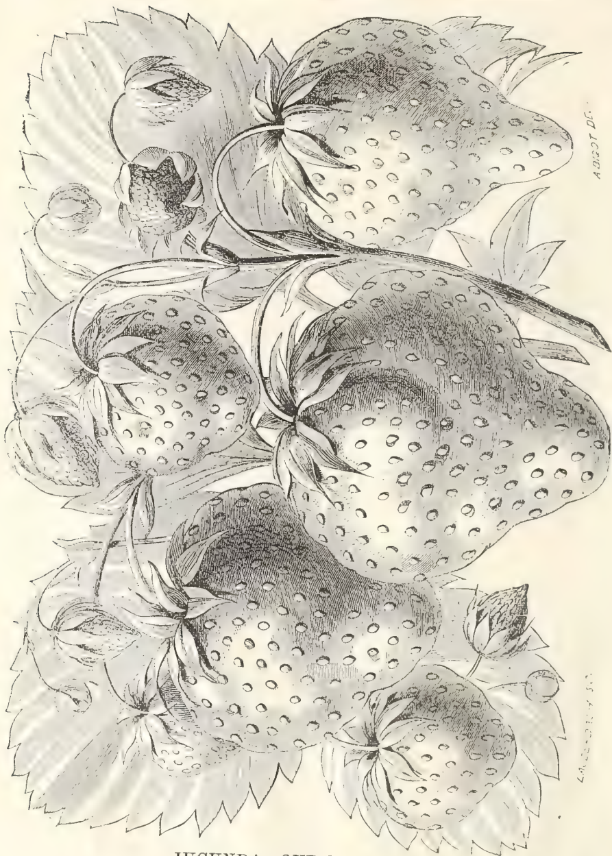
JUCUNDA—OUR No. 700. B.