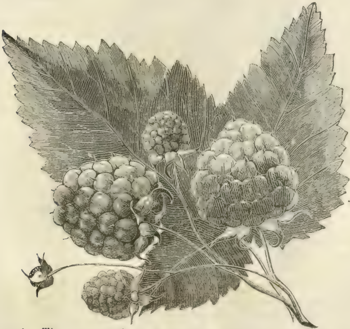
Hornet. —The largest of all raspberries, rich, crimson color, very

At a very heavy expense we received nearly the entire stock of genuine plants, in the Spring and Fall of 1868. We have planted it largely on our grounds, and are entirely confident of being able to ship the fruit to great advantage, to New York, a distance of over four hundred miles. Fruit sent on from Cleveland—200 miles—looked as fresh as if just picked from the plants.