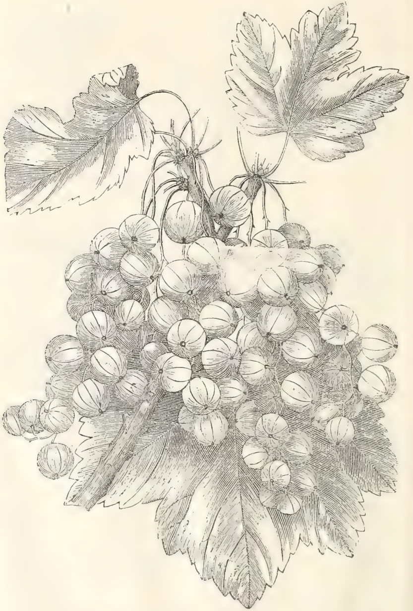
WHITE GRAPE CURRANT.