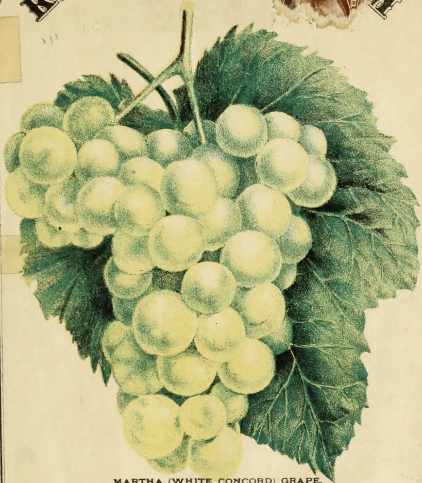
MARTHA (WHITE CONCORD) GRAPE.