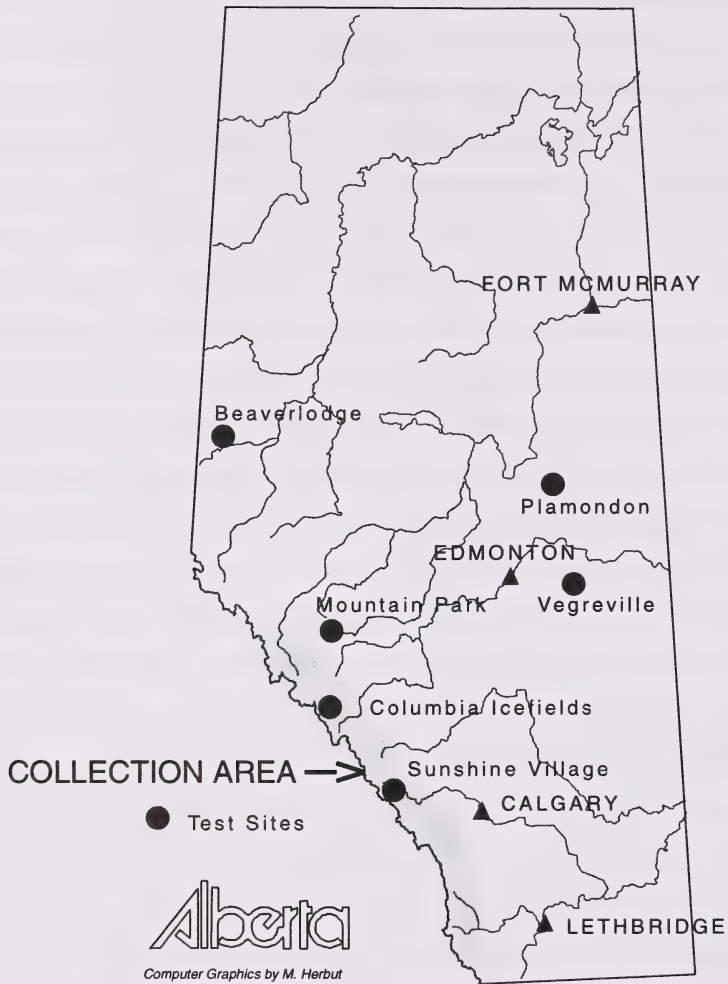
Fig. 1. Collection area and locations used to test selected lines of alpine bluegrass.