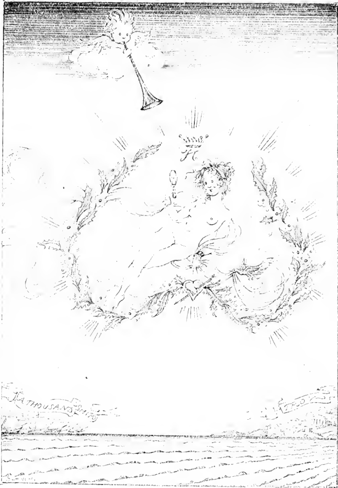
HELEN OF TROY