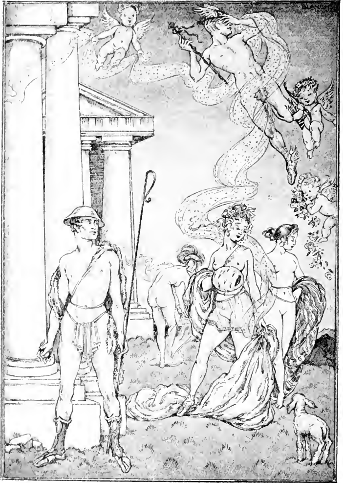
JUDGMENT OF PARIS