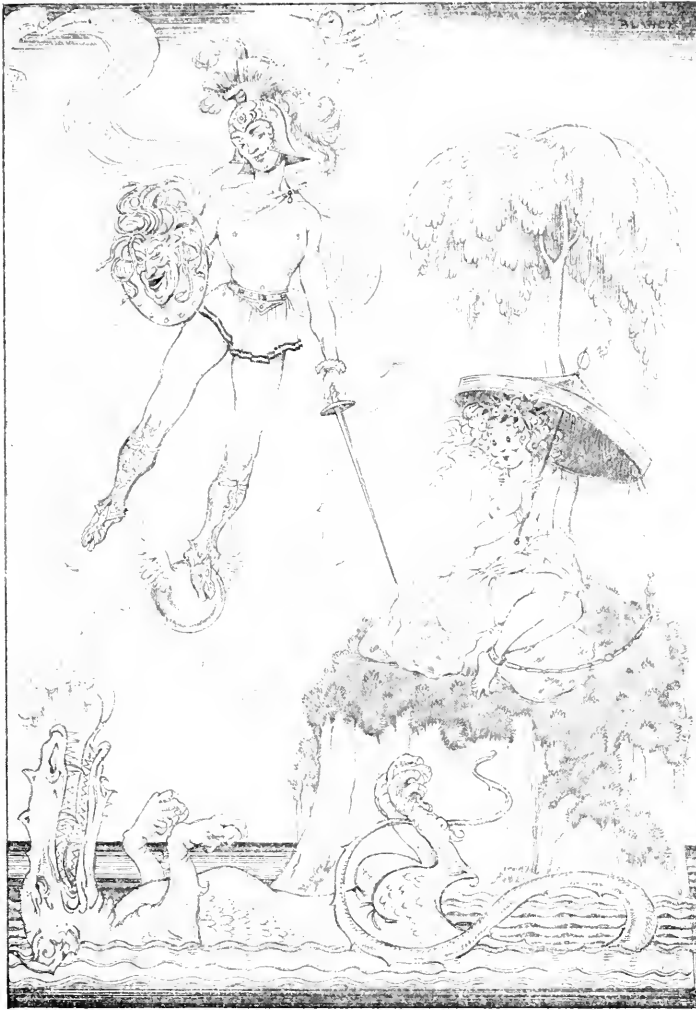
PERSEUS AND ANDROMEDA