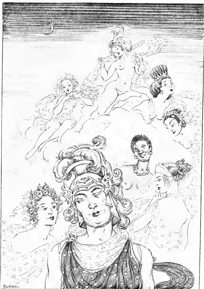
CHARMOLEAS OF MEGARA