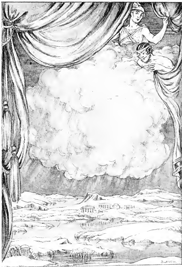
THE WORLD OF MORTAL MEN