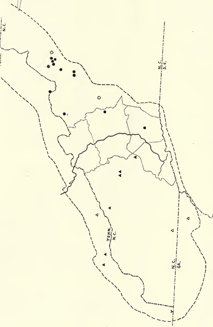
FIG. 28. Map of North Carolina and adjacent areas, showing distribution of species of Leurognathus . Circles = marmorata ; triangles = intermedia . Solid symbols indicate literature records, open ones new records. The circle with a cross indicates a sight record. The French Broad River (solid line) separates the two species. The broken line outlines the Blue Ridge Physiographic Province. White Top Mountain, Virginia, is indicated by X; Copperhill, Tennessee, by Y.