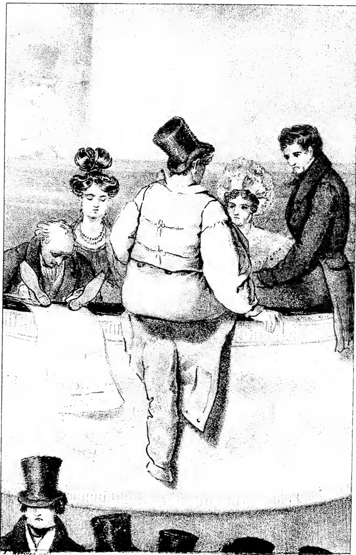
THE MAN IN THE TOP HAT