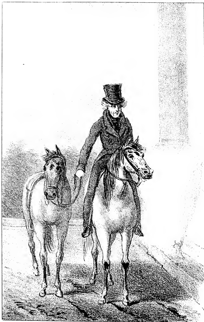
THE PRESIDENT OF THE UNITED STATES.