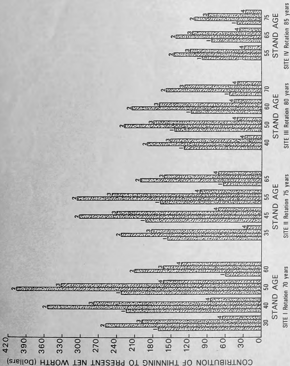
Figure 1.--Comparison of contribution to present net worth of commercial thinning in Douglas-fir stands varying by age and site class under each of four assumptions about price-diameter relationships. Discount rate is 5 percent.