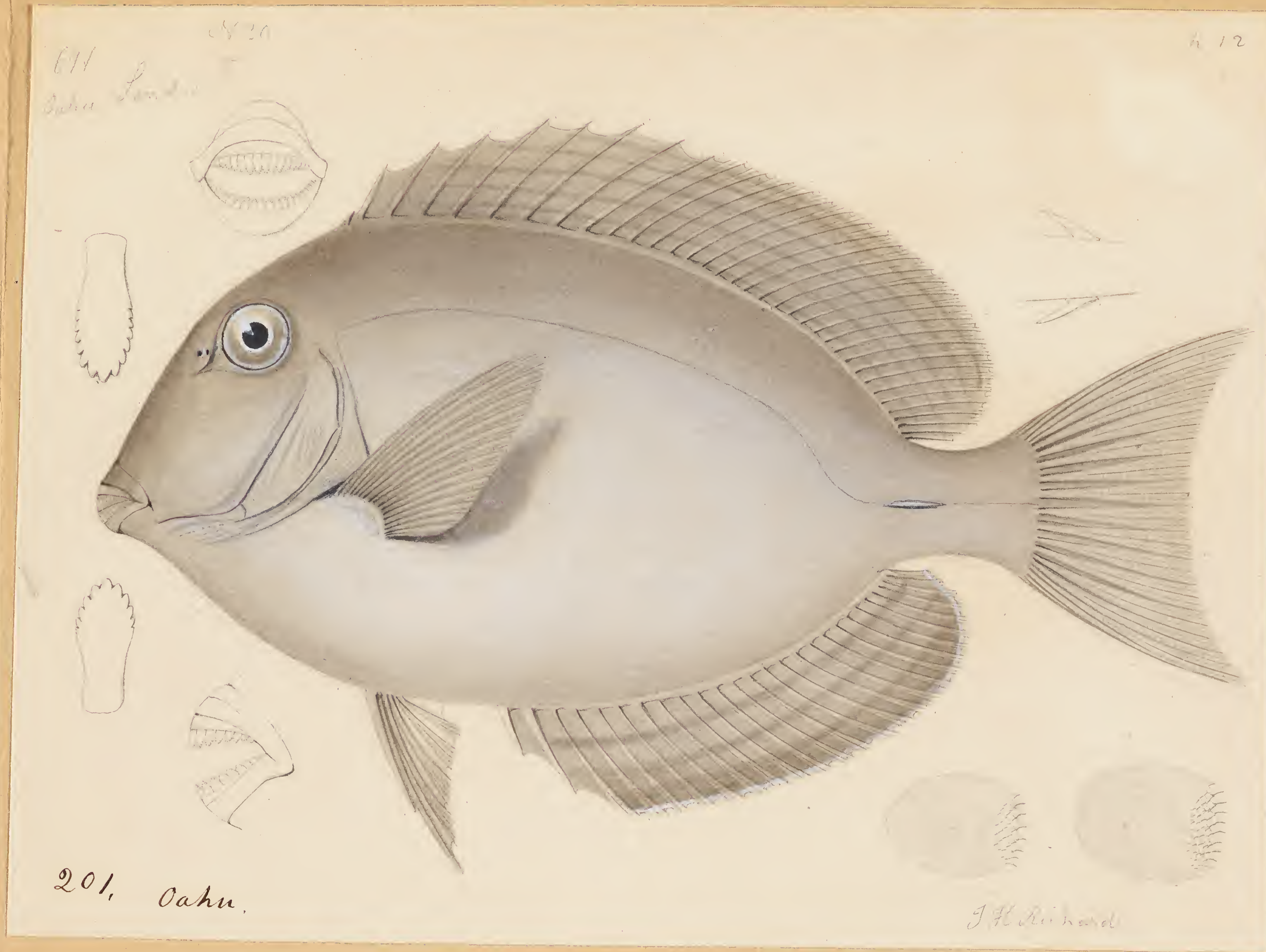
Fig. Hepatus fuliginosus (Lesson)