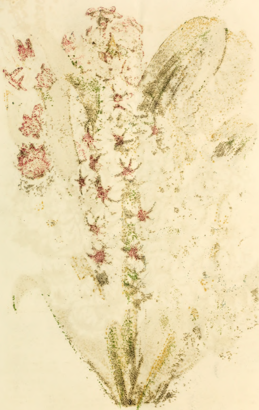
ANTHURUS LINDLEYANA YATES