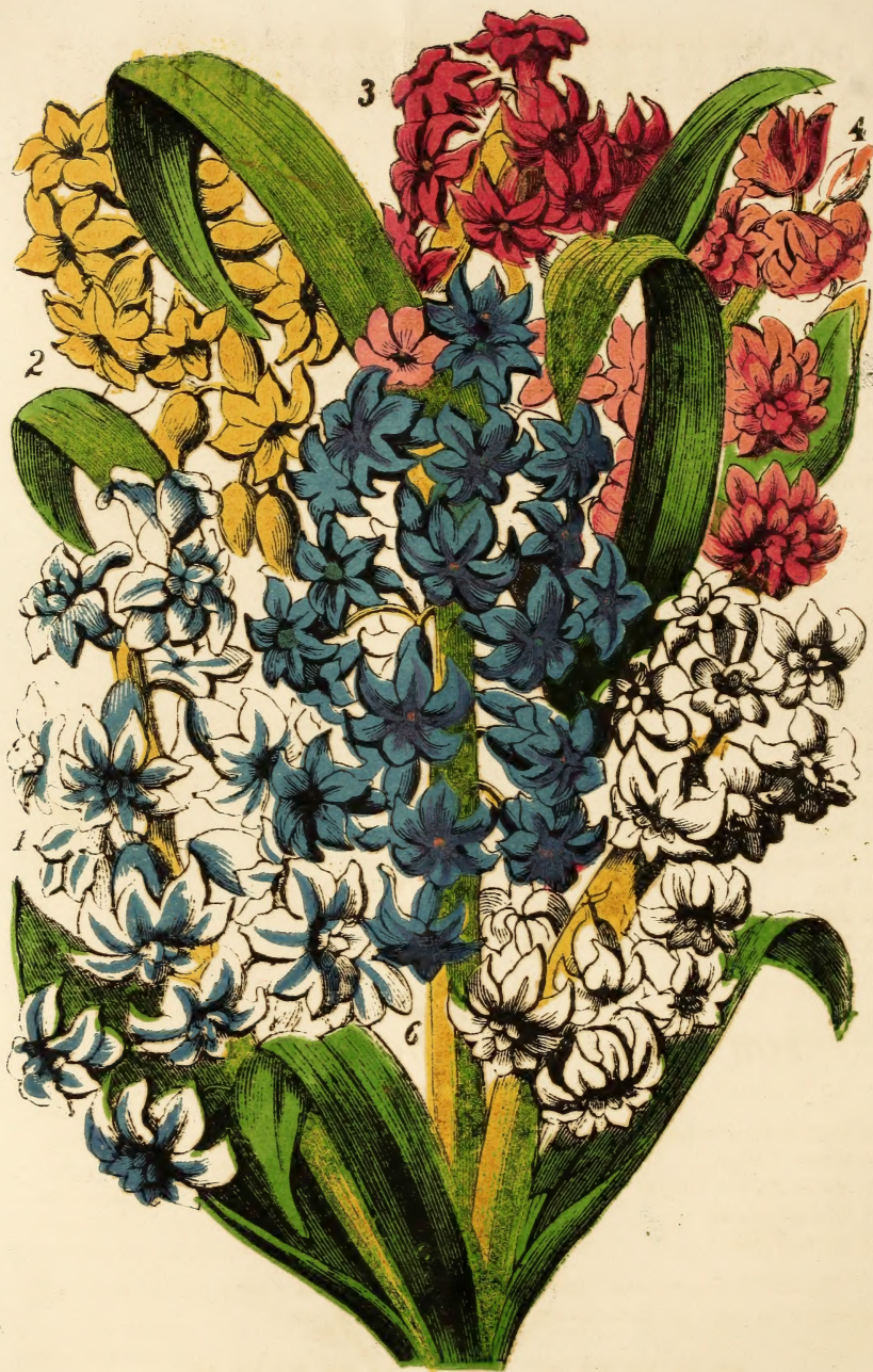
DOUBLE AND SINGLE HYACINTHS.