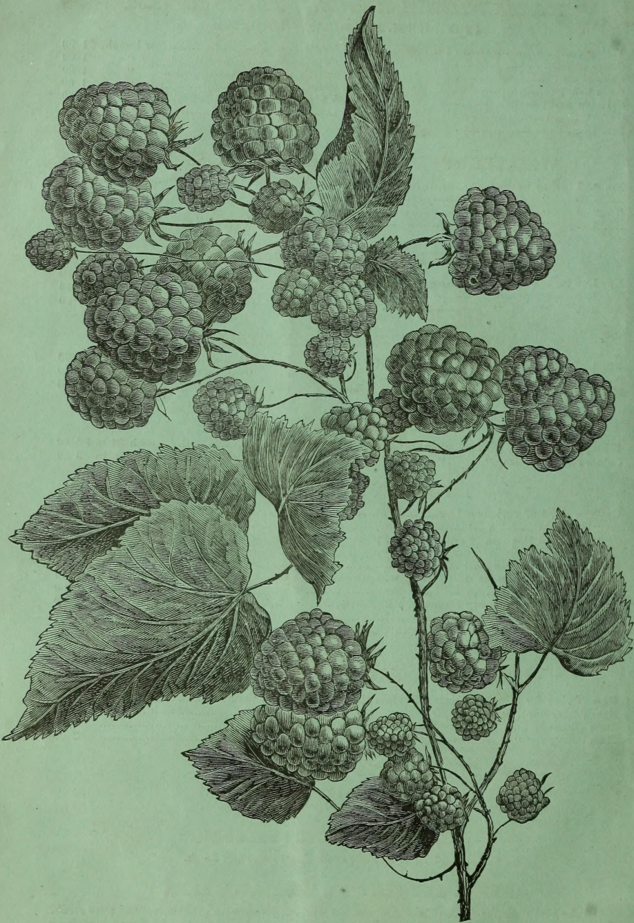
NEW RASPBERRY "HERSTINE." See page 23.